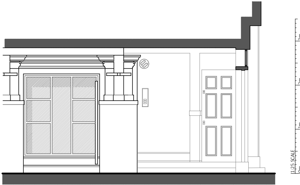
SECTION B-B AS EXISTING