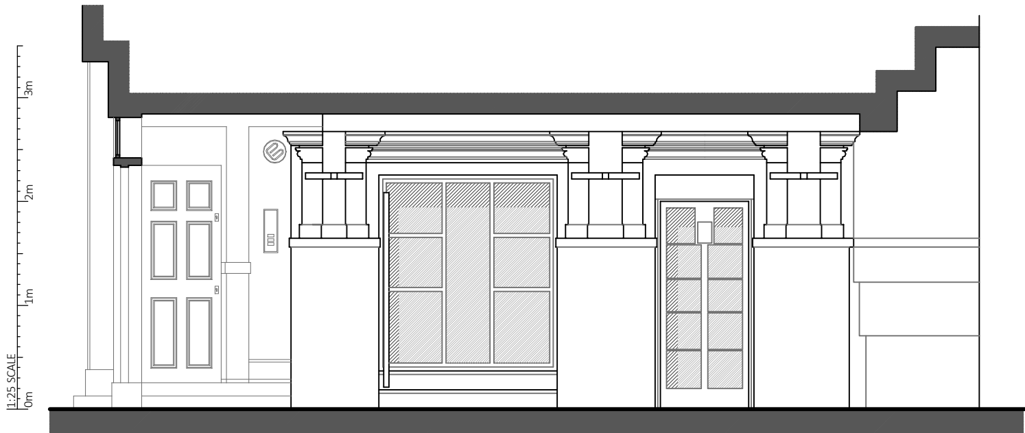
SECTION A-A AS EXISTING