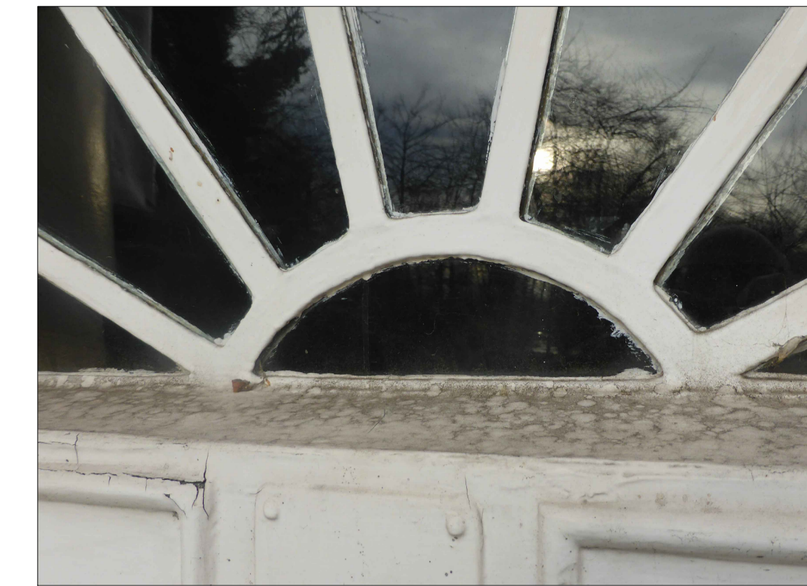
Existing fan light: No10 central area