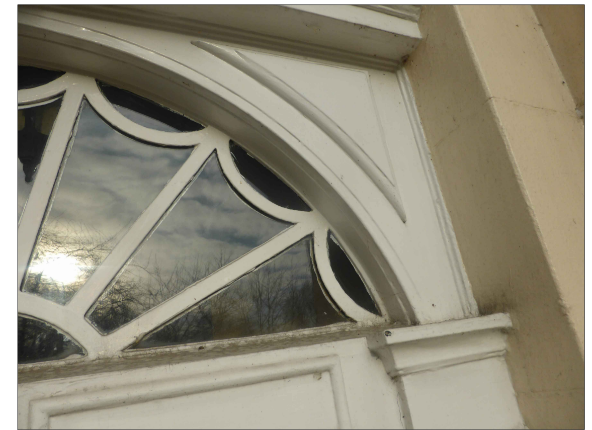
Existing fan light: No10 side area