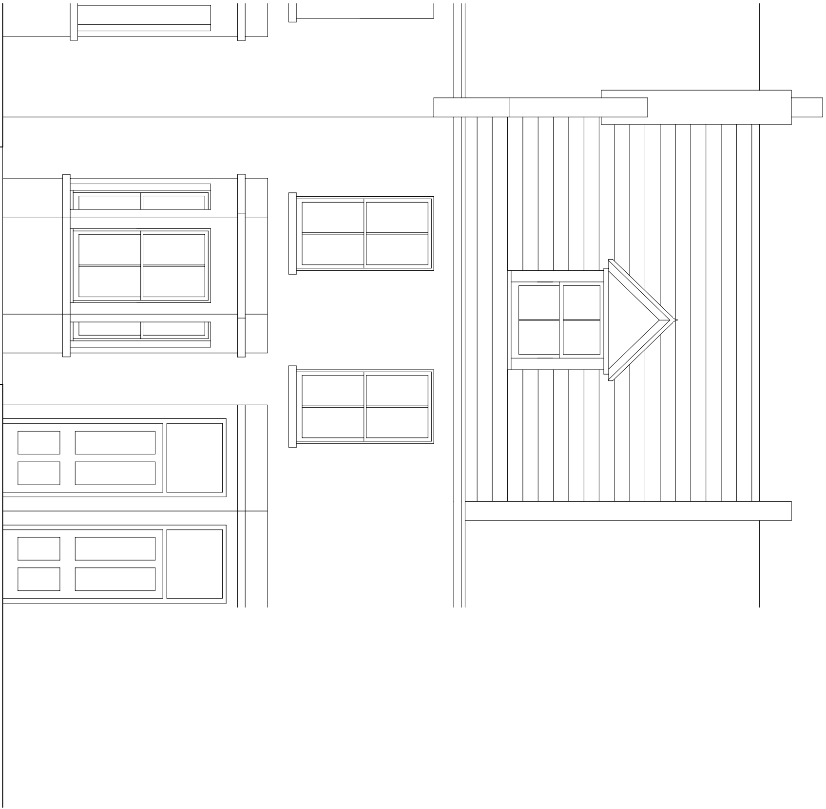
FRONT ELEVATION AS PROPOSED NEW BAY WINDOW NEW LIGHT WELL NEW WHITE PAINTED SW WINDOWS AND FRENCH DOORS