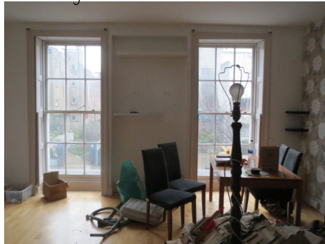
surviving shutters and windows