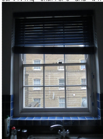
modern replacement window