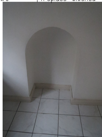
blocked fireplace with arch