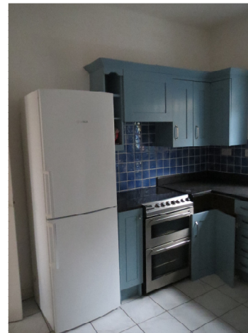
modern linings in rear room