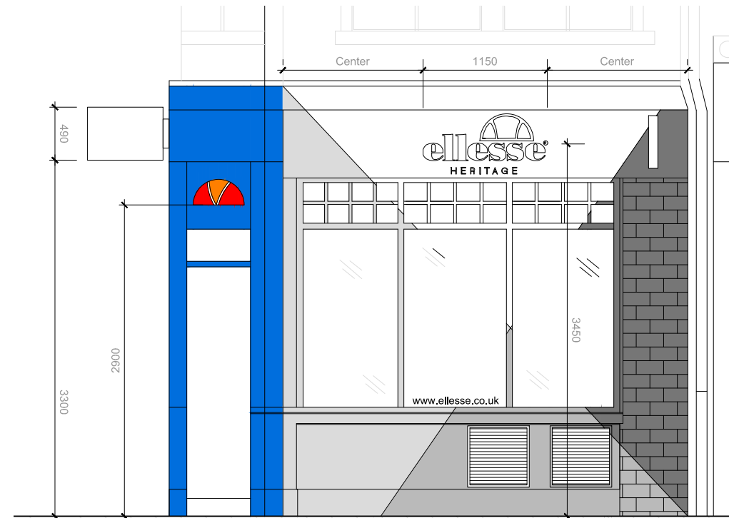
3 NEAL STREET - SHOP FRONT ELEVATION SCALE 1 : 50