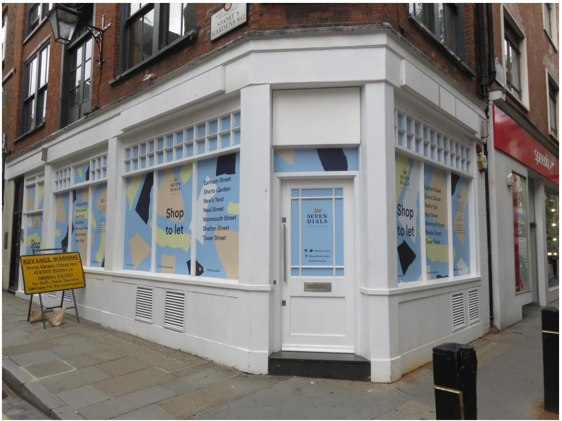
(Image 1) Existing Shop front at the corner of Neal Street and Short's Gardens, Covent Garden

39 Neal Street, WC2H 9QG London, UK - Ellesse Pop Up Store