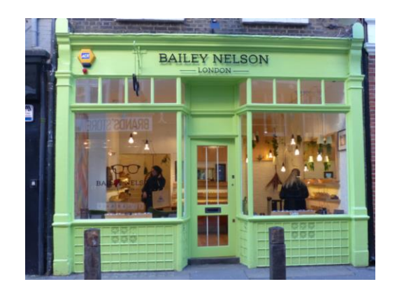
(Image 2) Neighbouring shop – Pylones, 54 Neal Street, Covent Garden (Image3) Neighbouring shop – Bailey Nelson, 69 Neal Street, Covent Garden