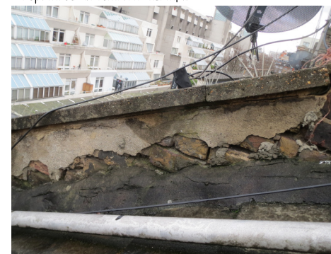
party wall - poor