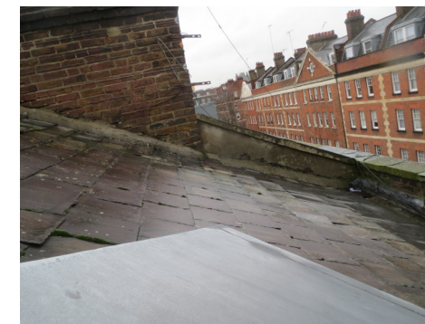
missing slates and intrusive services