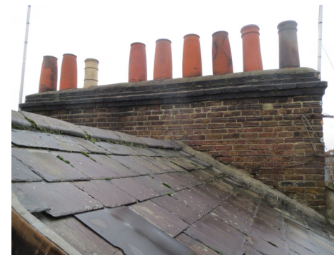
ORIGINAL SLATES and ridge tiles