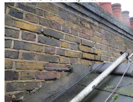
repointed brickwork harmful