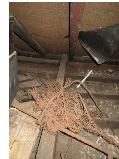
PARAPET GUTTER BOARD IN CRITICAL CONDITION