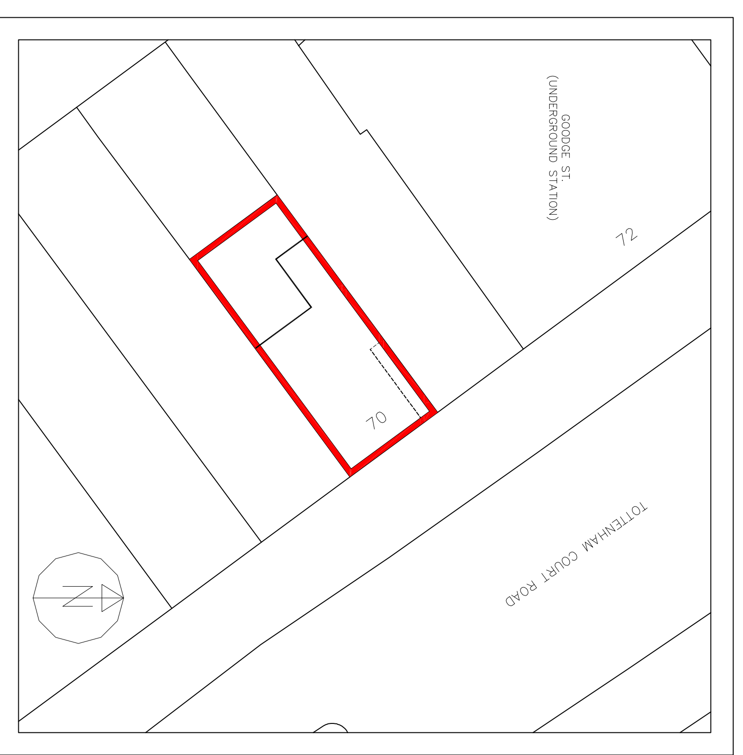
SITE PLAN Scale 1:200 @ A1

CeX Ltd 11 Northburgh Street, London EC1V 0AH e-mail: cexdesign@webuy.com Contractors must verify all dimensions on site before commencing work. Only work to given dimensions DO NOT SCALE DRAWINGS. The copyright of this drawing is reserved and the drawing must not be disclosed without the authority of CeX Ltd.