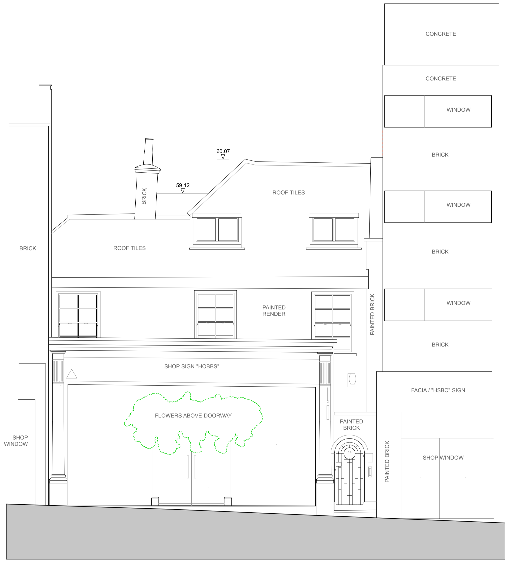
Front/Street Elevation - Existing