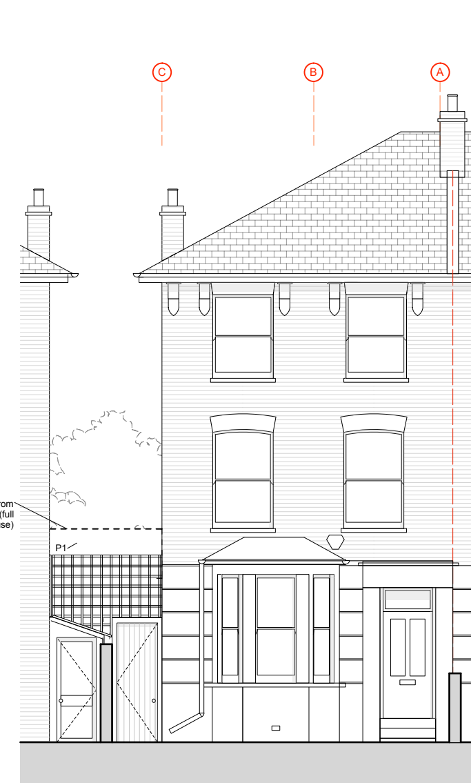
PROPOSED FRONT ELEVATION 0 1 2 3 4 5m