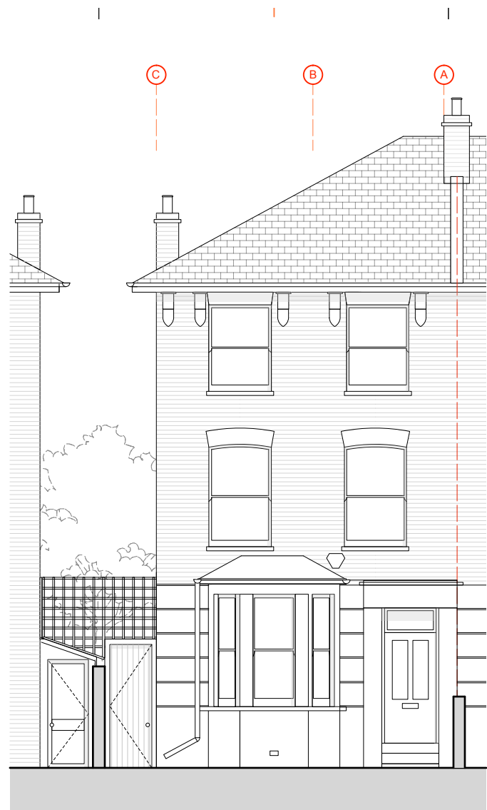
EXISTING FRONT ELEVATION 0 1 2 3 4 5m