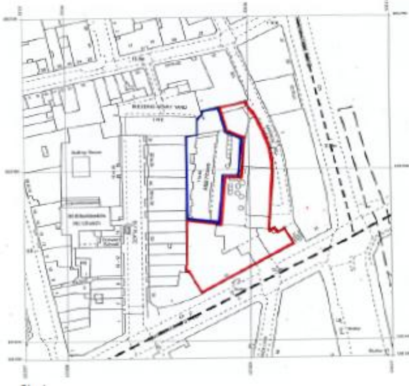
Figure 1.1: Proposed Development Site Location