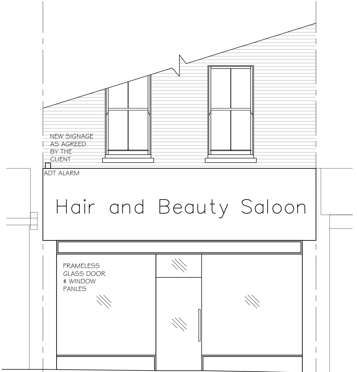
PROPOSED ELEVATION 1:100