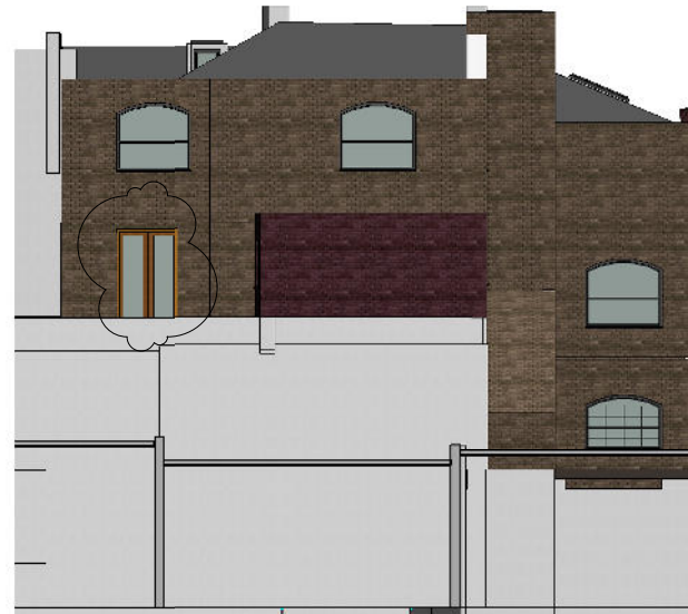
Proposed North Elevation Scale 1:200