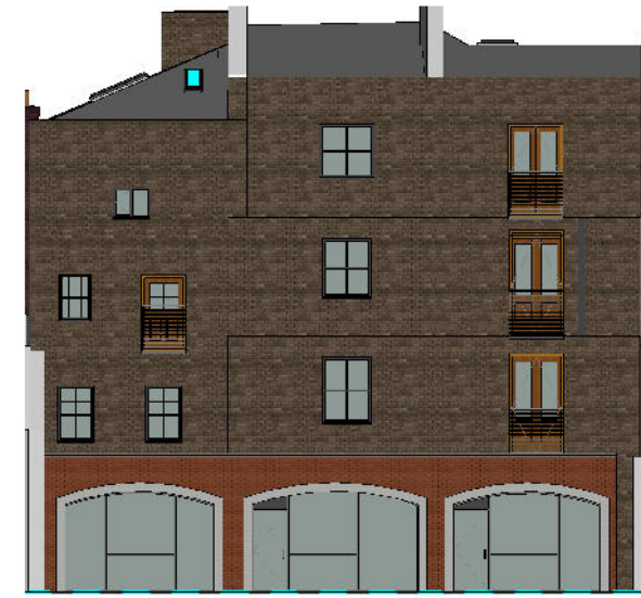
Proposed South Elevation Scale 1:200