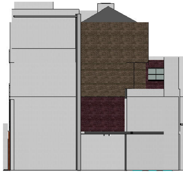
Proposed East Elevation Scale 1:200