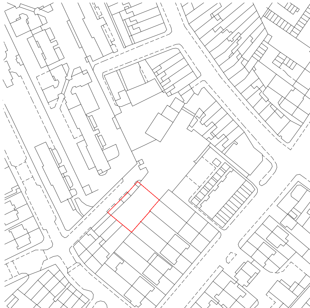
SITE LOCATION PLAN SCALE 1:1000