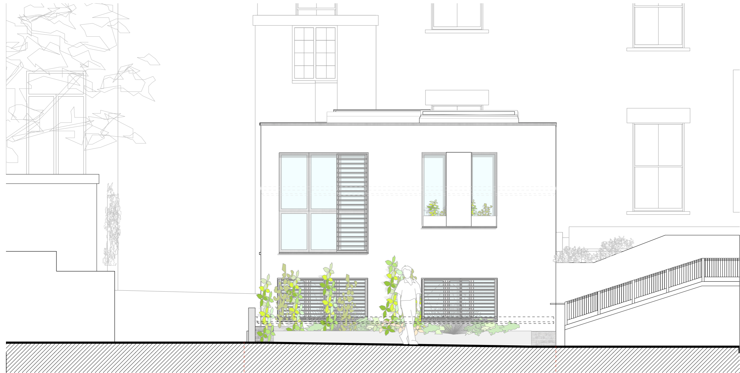
proposed: west elevation