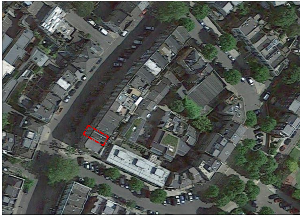
[04] EXISTING AERIAL PHOTO