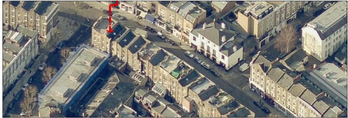
[03] EXISTING SITE PHOTOS