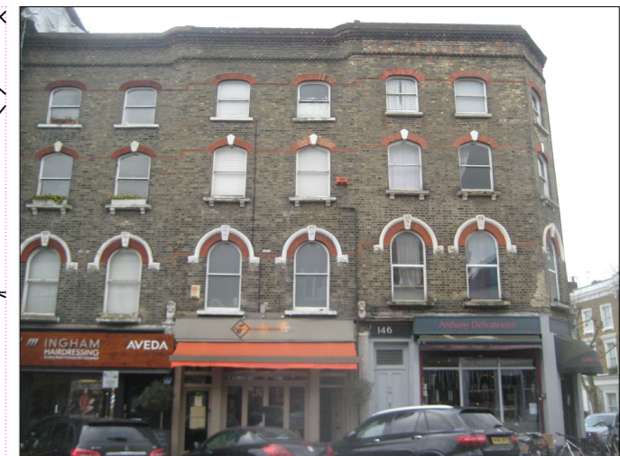
[06] EXISTING SITE PHOTO