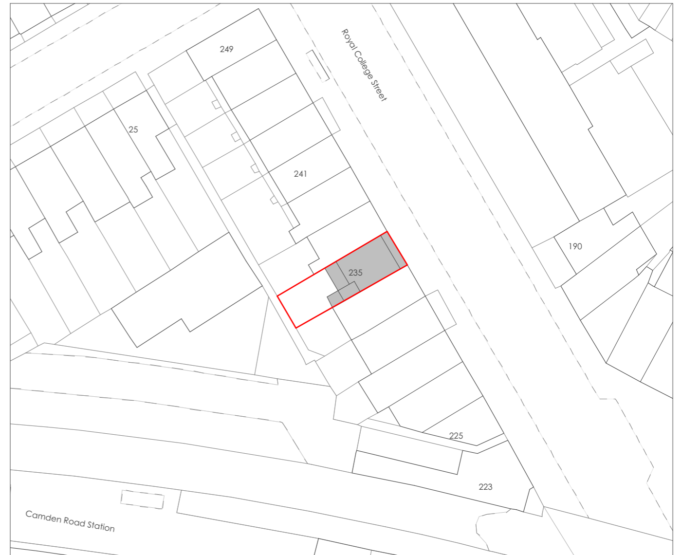
BLOCK PLAN scale 1:500