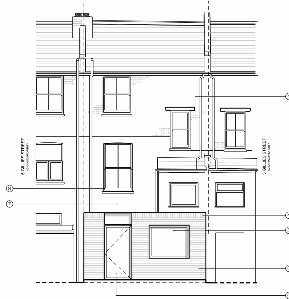
PROPOSED SOUTH WEST FACING ELEVATION