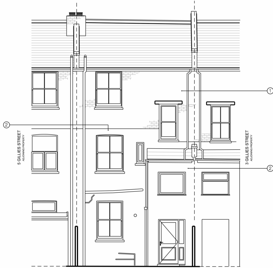
EXISTING SOUTH WEST FACING ELEVATION