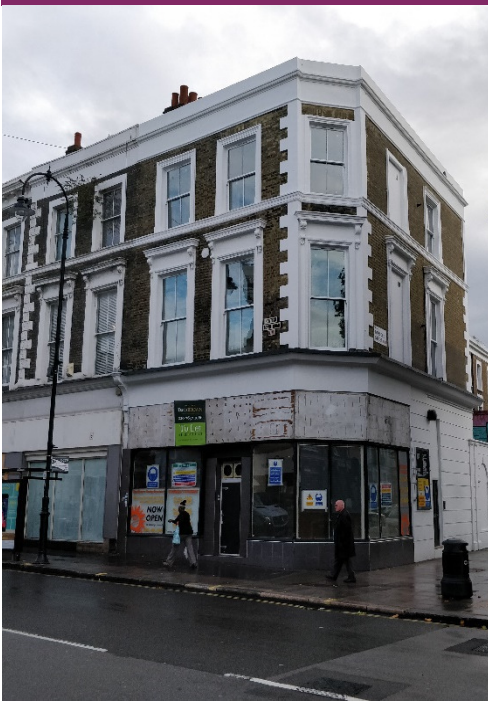
F.2 Existing Shopfront

2.7. Figure 2 below displays the appearance of the existing shopfront and figure 3 shows the in-filled windows along Gaisford Street.