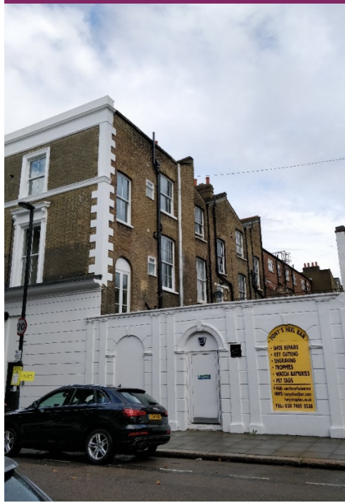
F.3 In-filled Windows along Gaisford Street