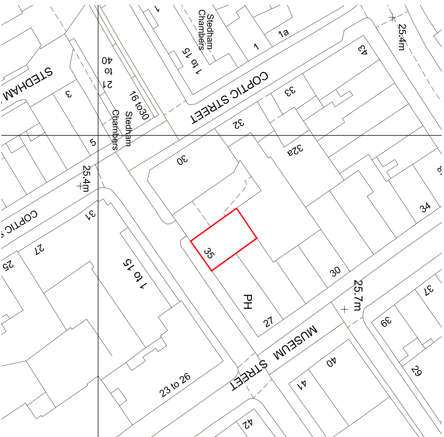
Site Location Plan 1:500 @ A3