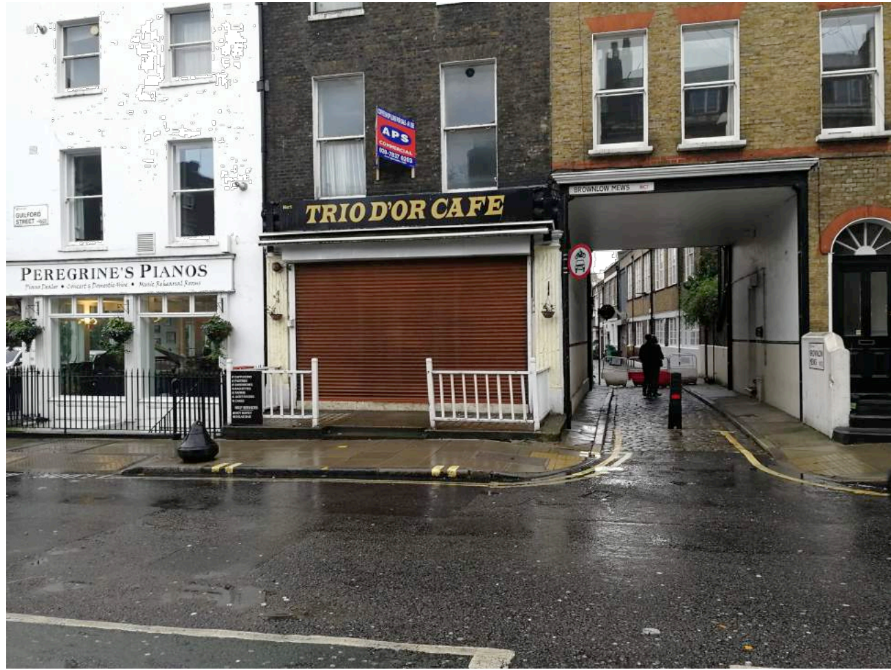
1 No.1 Guilford Street Ground Floor Elevation