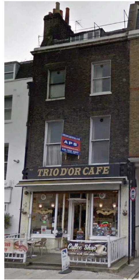
2 No.1 Guilford Street Elevation