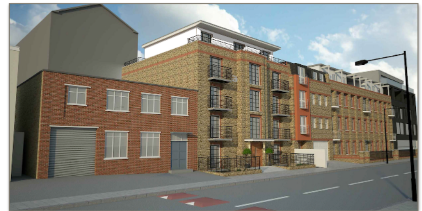
PROPOSED SITE PERSPECTIVE VIEW