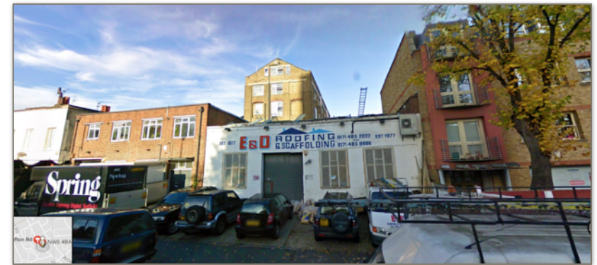
EXISTING SITE PERSPECTIVE VIEW

This statement has been prepared to discuss the proposed residential use and justify how the loss of the industrial existing use and proposed residential use comply with the Camden Local Plan.