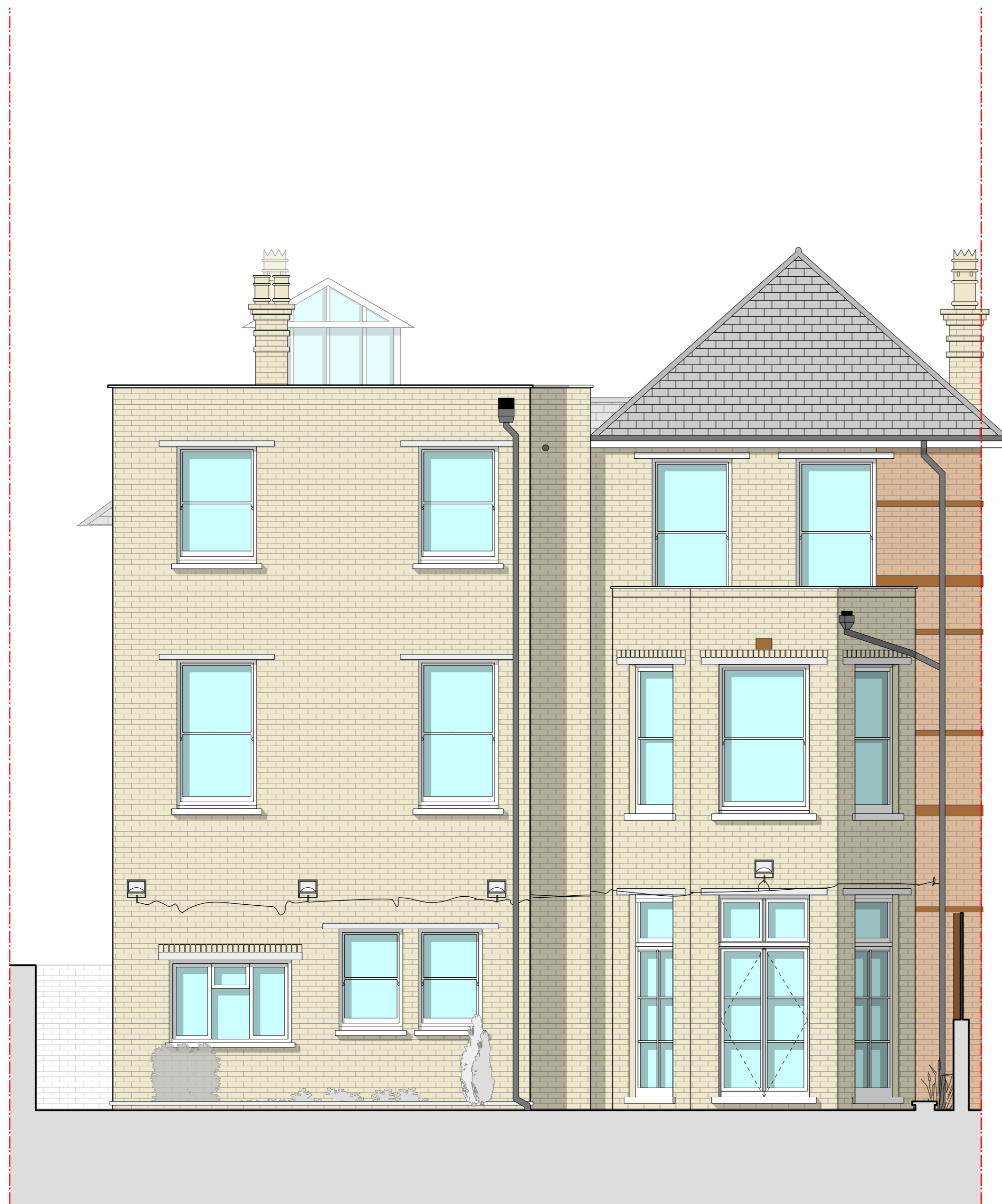
1 Existing Section B Scale: 1:50