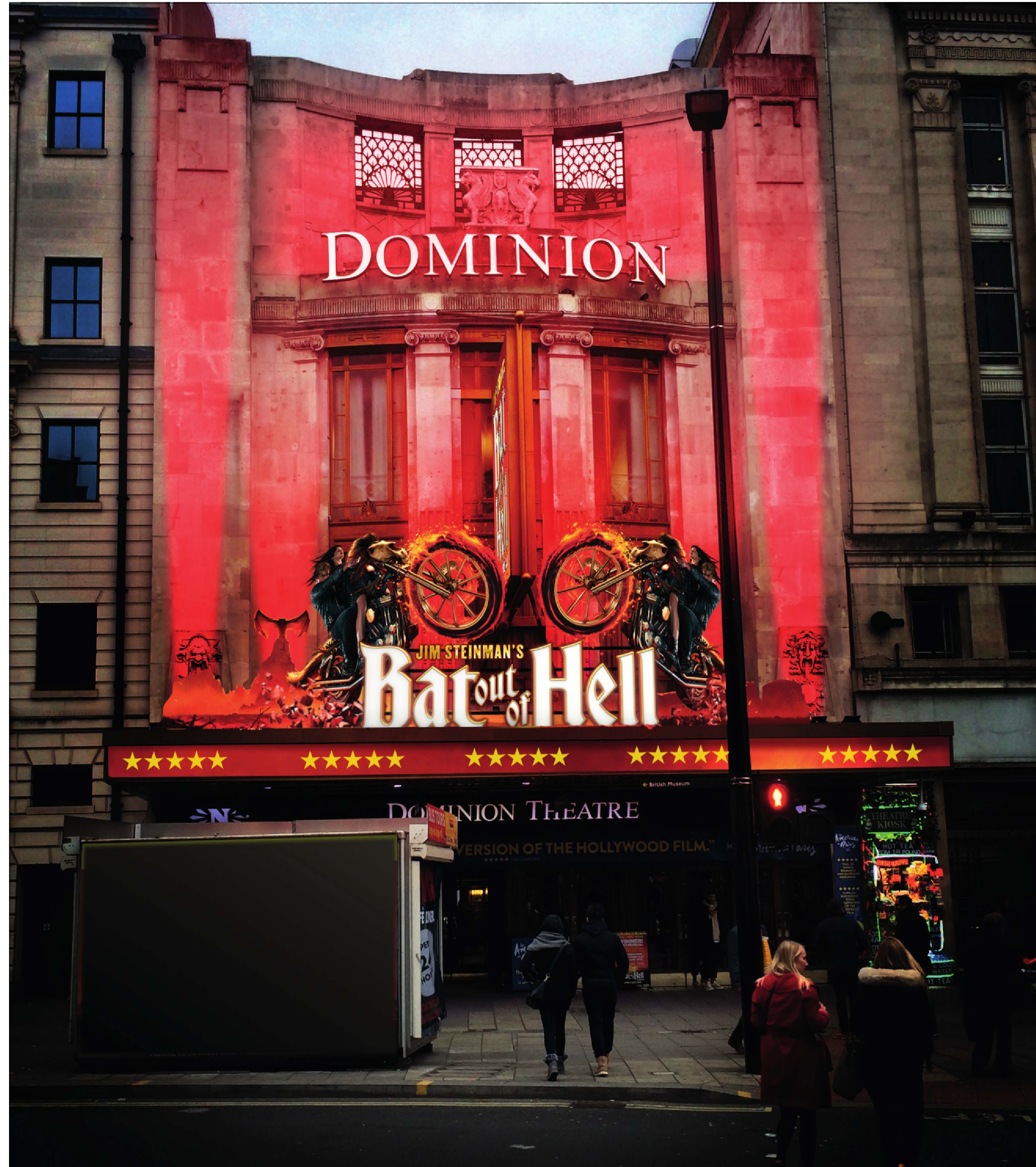
PROPOSED PHOTOGRAPHIC IMAGE OF FRONT ELEVATION (NTS)