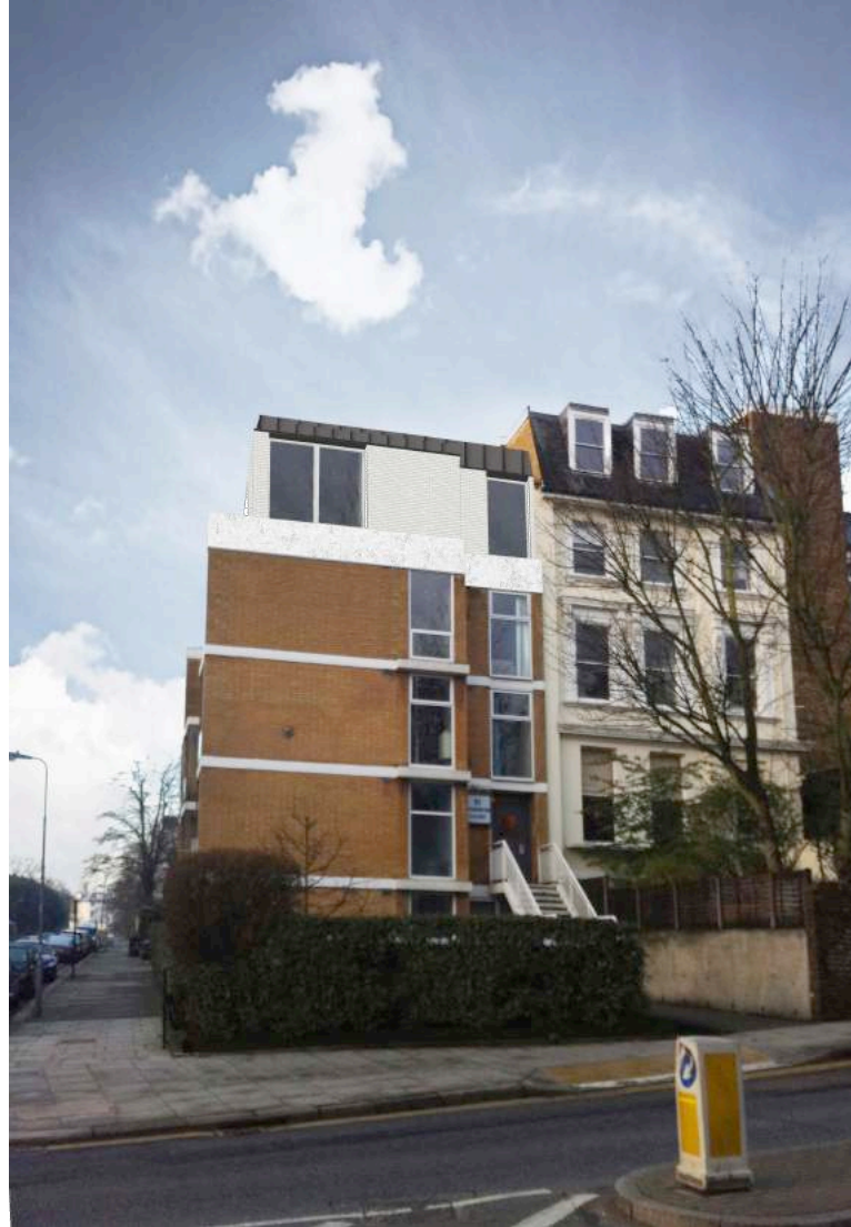
View 4: from opposite pavement on Haverstock Hill