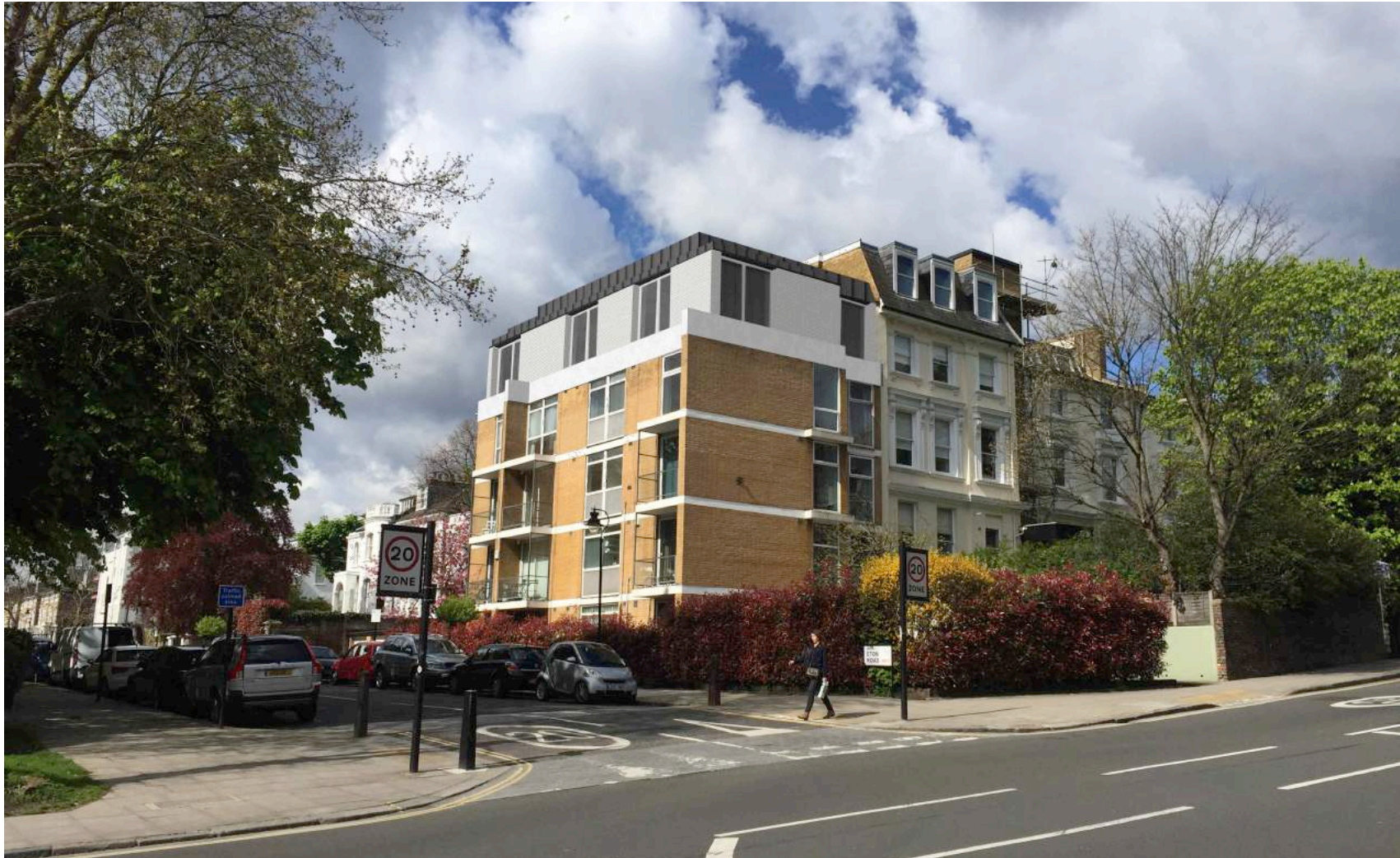
View 5: from opposite pavement on Haverstock Hill adjacent to church