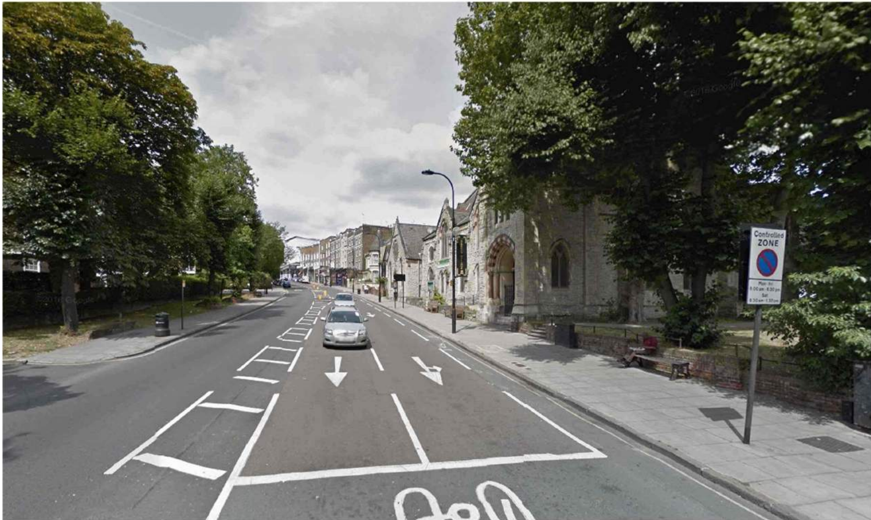
View 9: from corner of Haverstock Hill and Prince of Wales Road