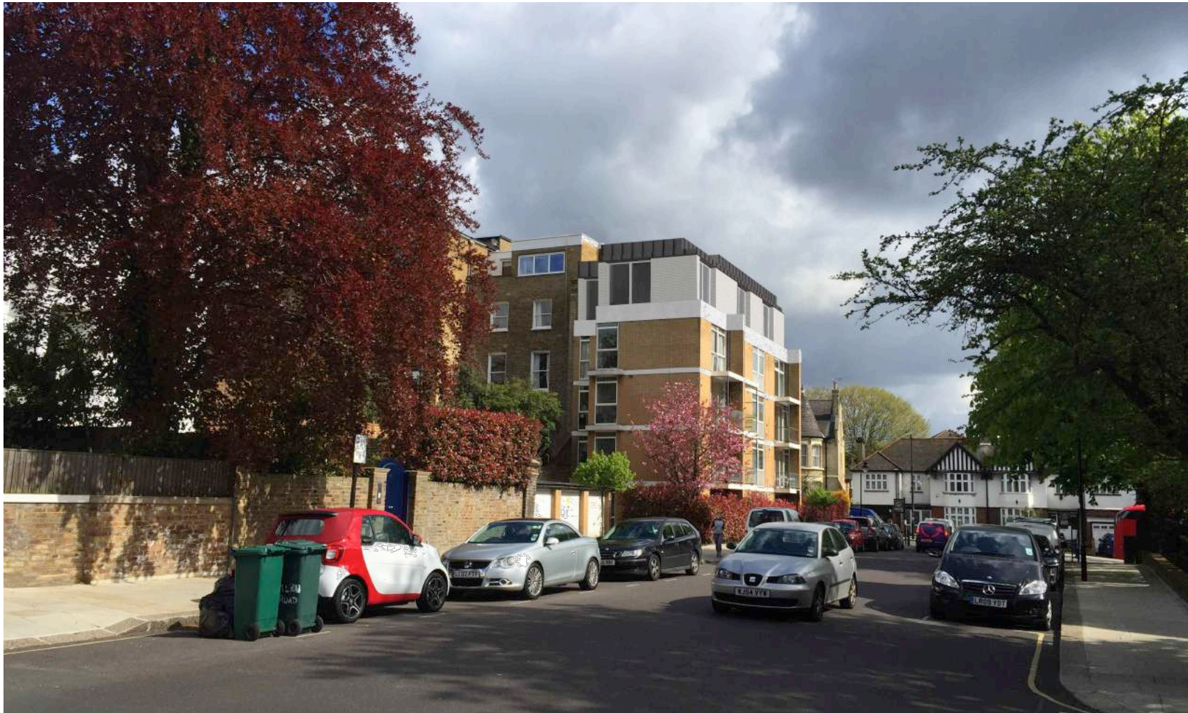
View 2: from corner of Eton Road and Eton College Road