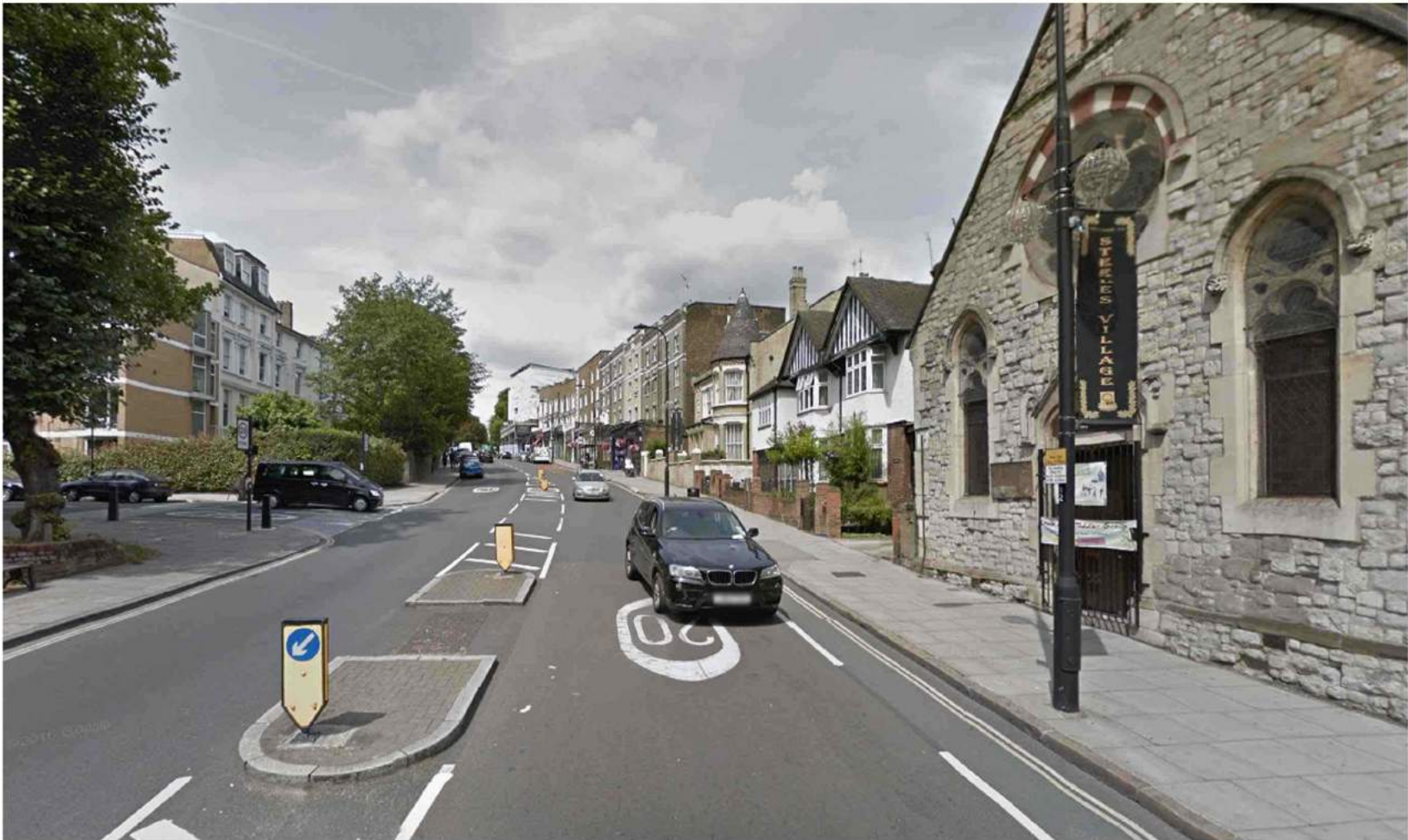
View 6: from lower down Haverstock Hill (see plan)