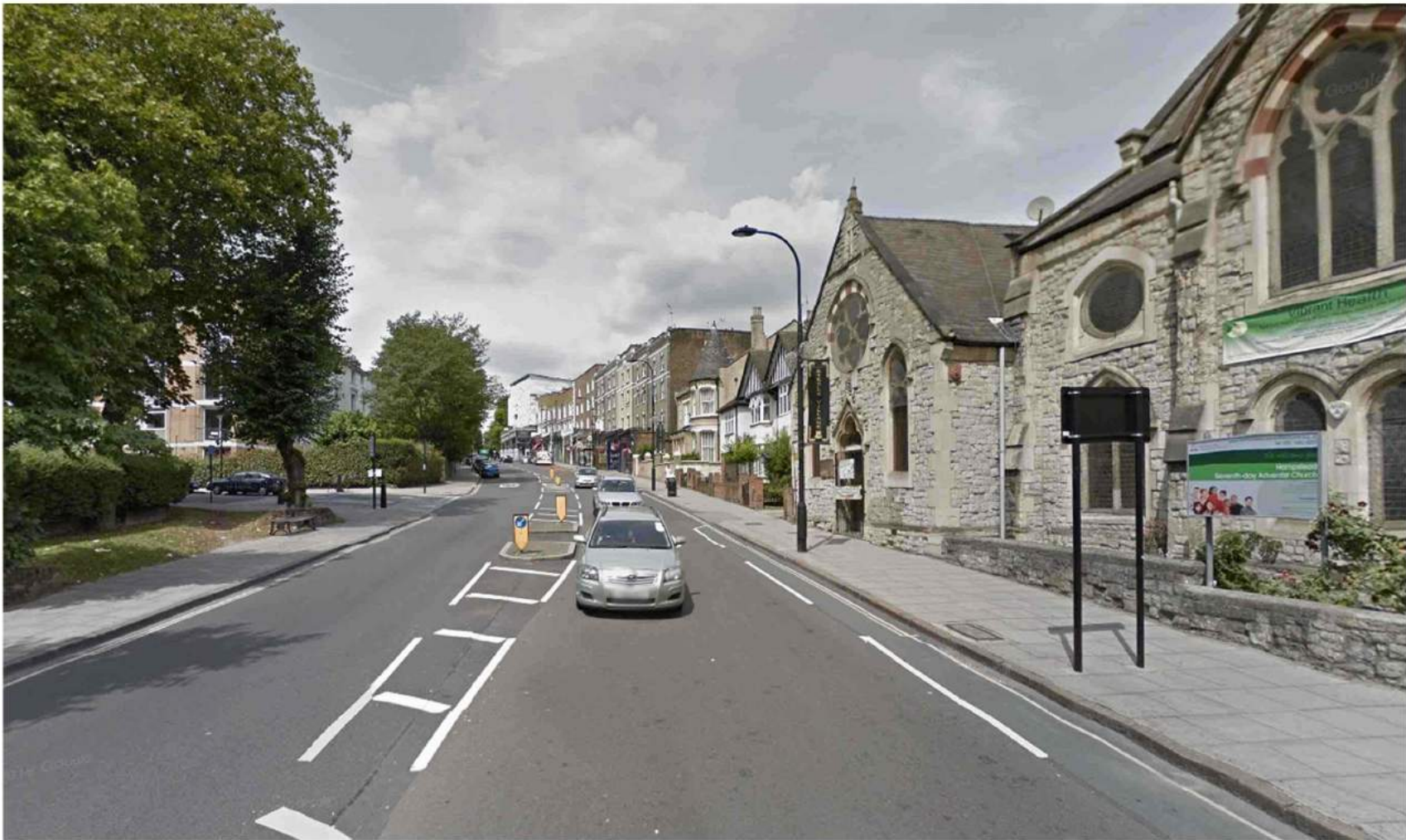
View 7: from lower down Haverstock Hill (see plan)