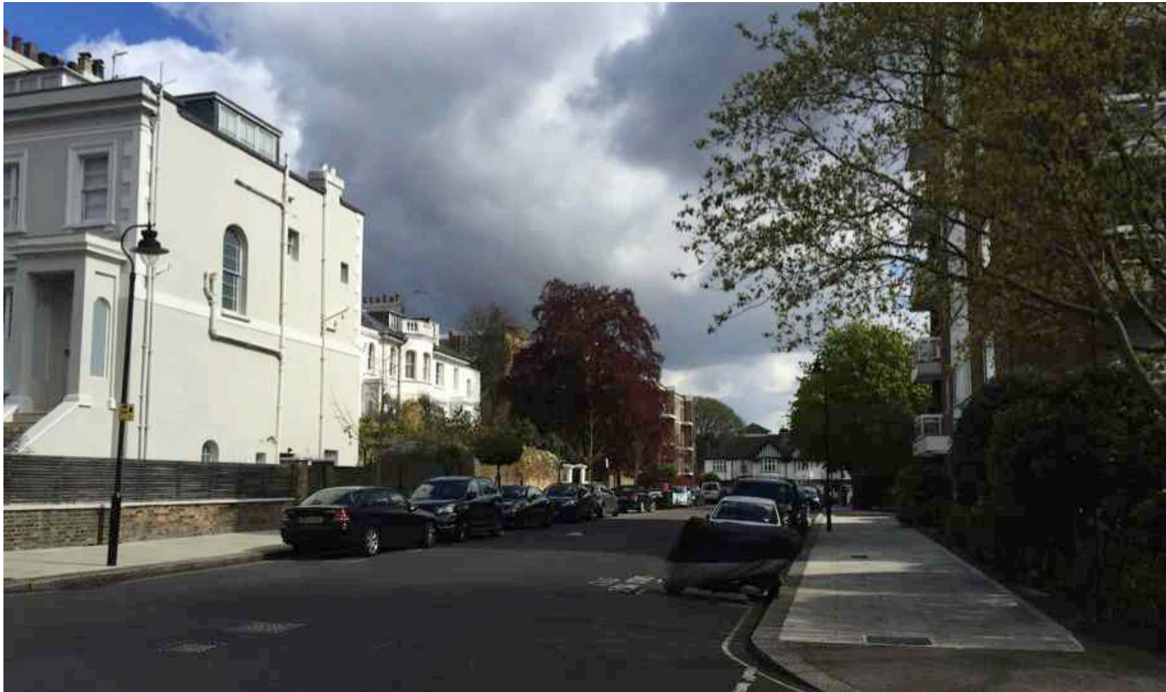
View 1: from corner of Eton Road and Eton Villas