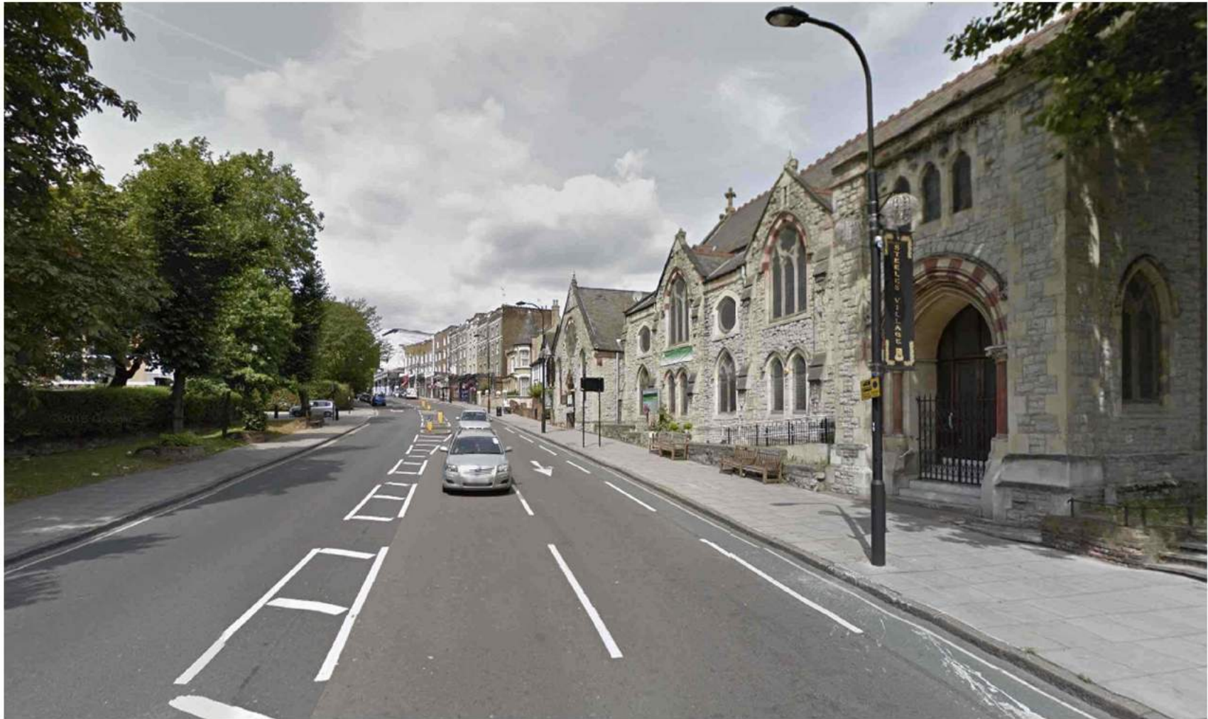
View 8: from lower down Haverstock Hill (see plan)