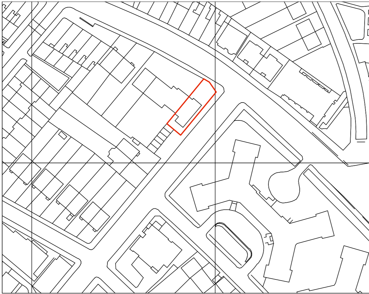
01 Location plan 1:1250 at A3