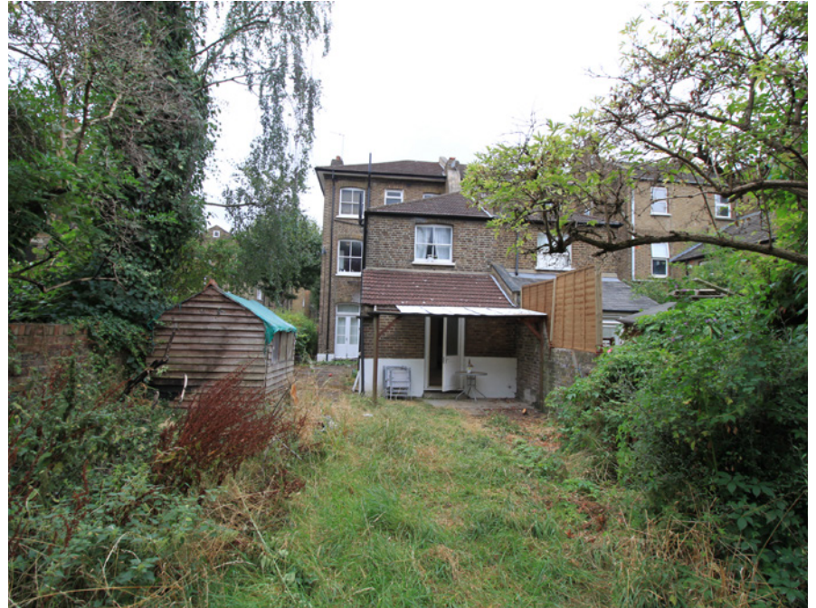
View from rear garden