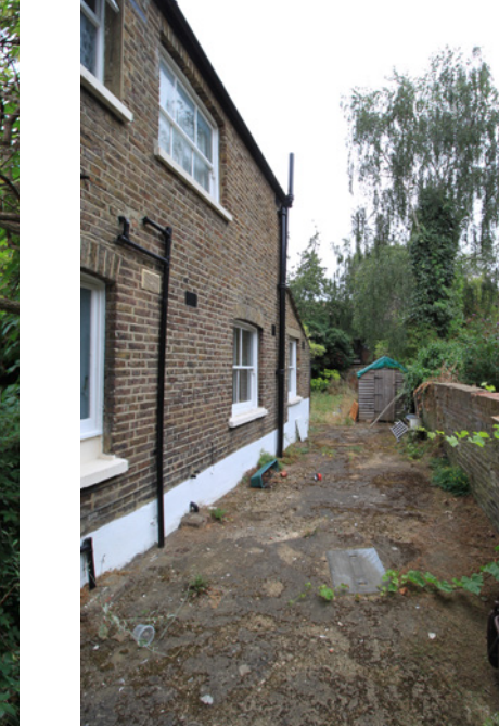
View to rear garden from side passage