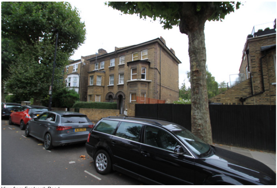
View from Fordwych Road