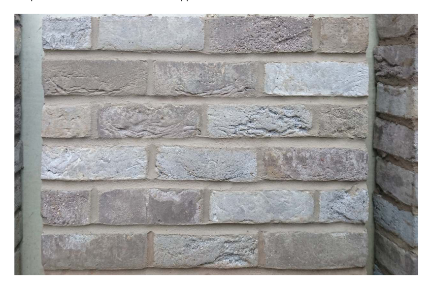
Proposed Brick Mix: Sample Panel (On site)