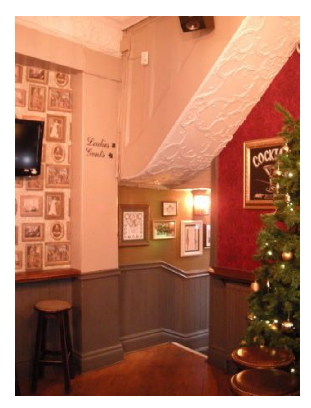
Form a new half glazed fire door above the step line down to the gents toilets. This door will be held open on a magnetic hold linked to the fire alarm.