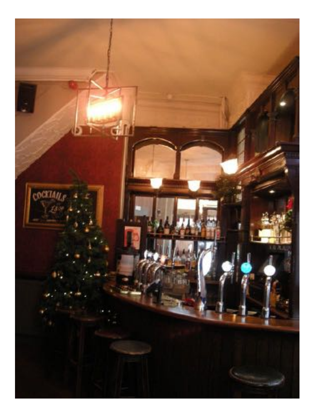
The existing plaster ceiling and dado panelling will remain intact.