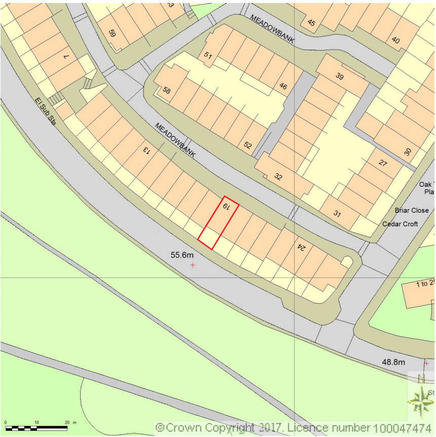
1 Location plan 1:1250