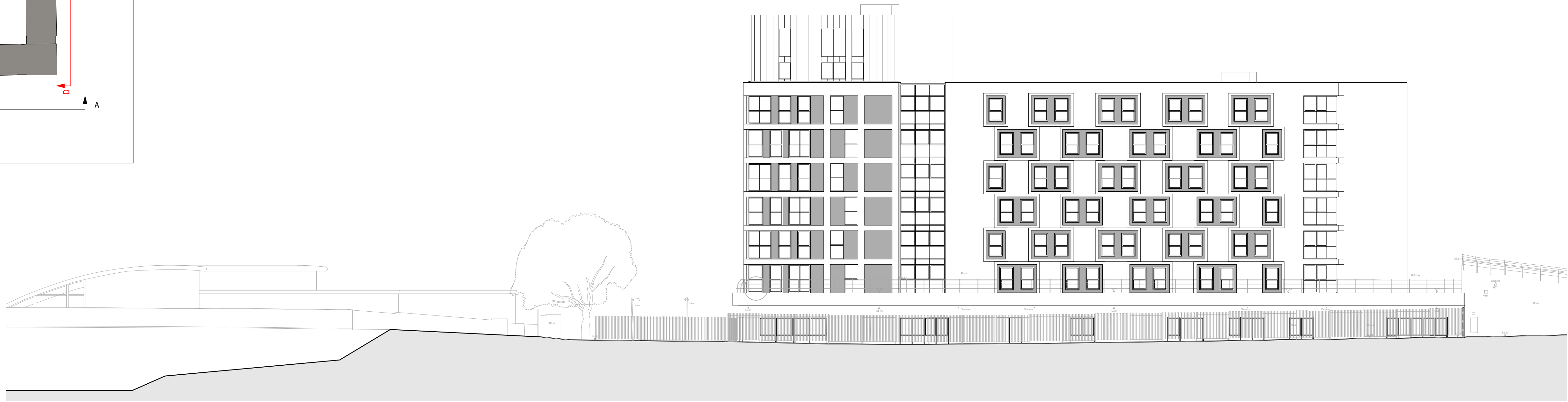
01 Existing North Elevation Scale 1 : 400 @ A3