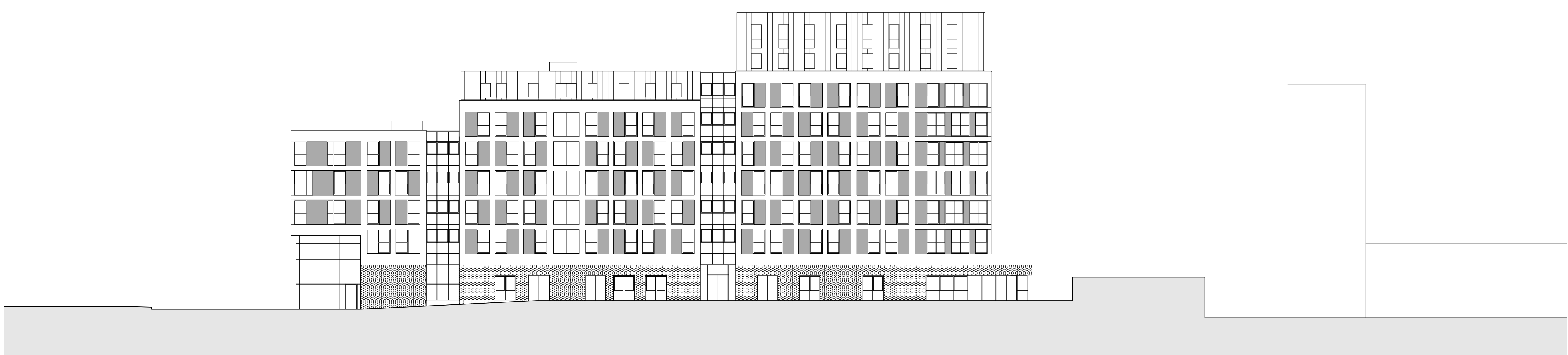
02 Existing East Elevation Scale 1 : 400 @ A3