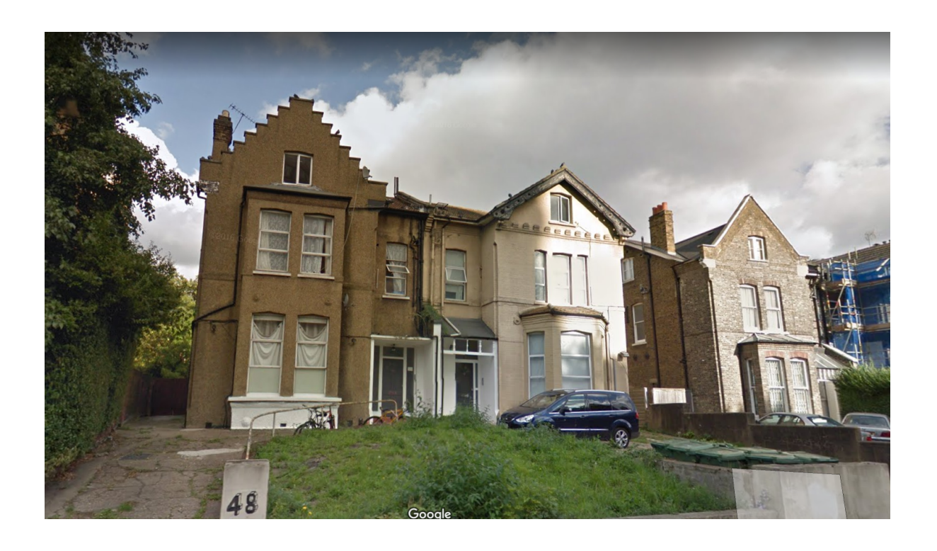
Front of 46 & 48 ShootUp Hill NW2 3QB