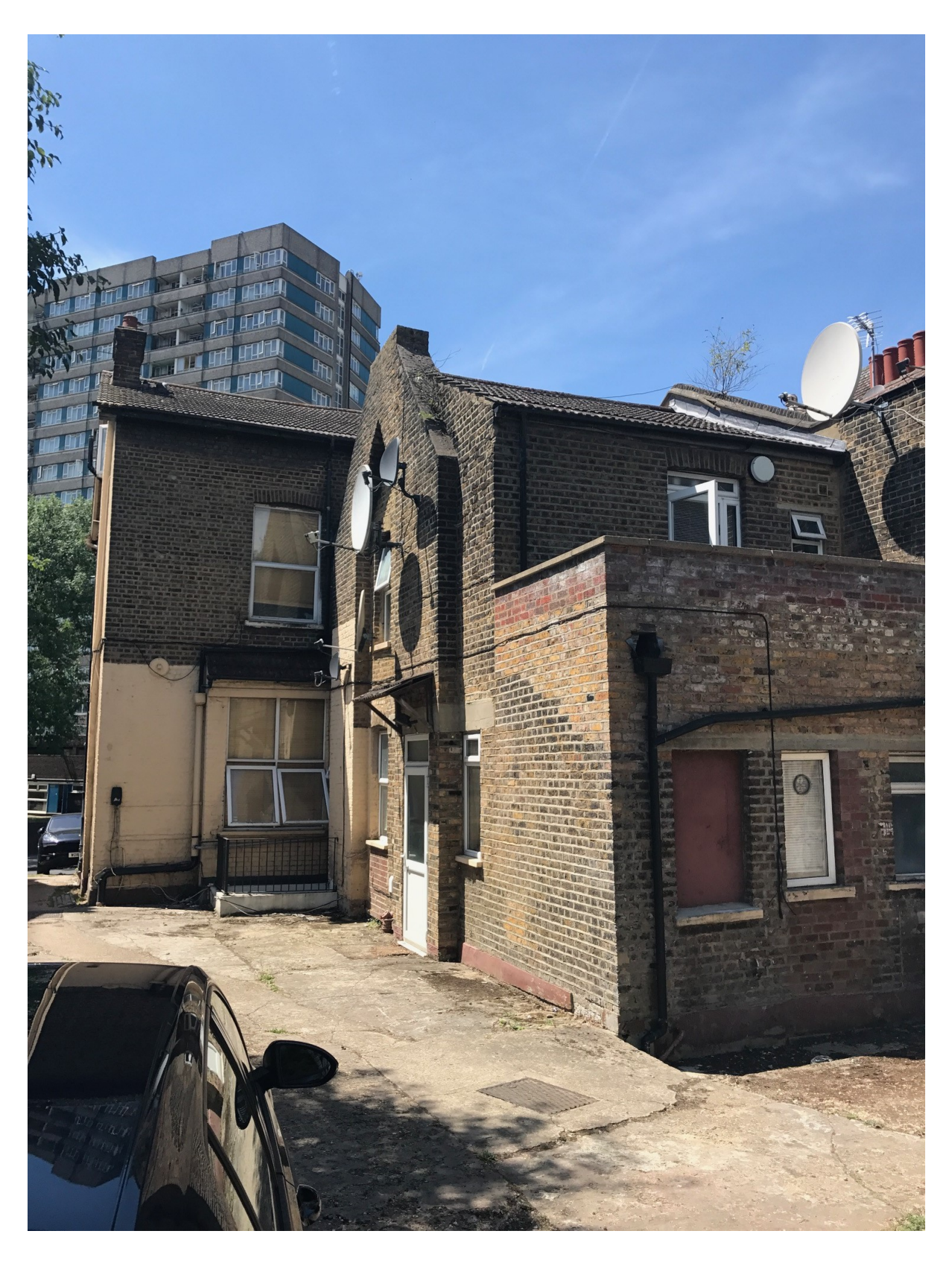
Rear of No 46 ShootUp Hill NW2 3QB