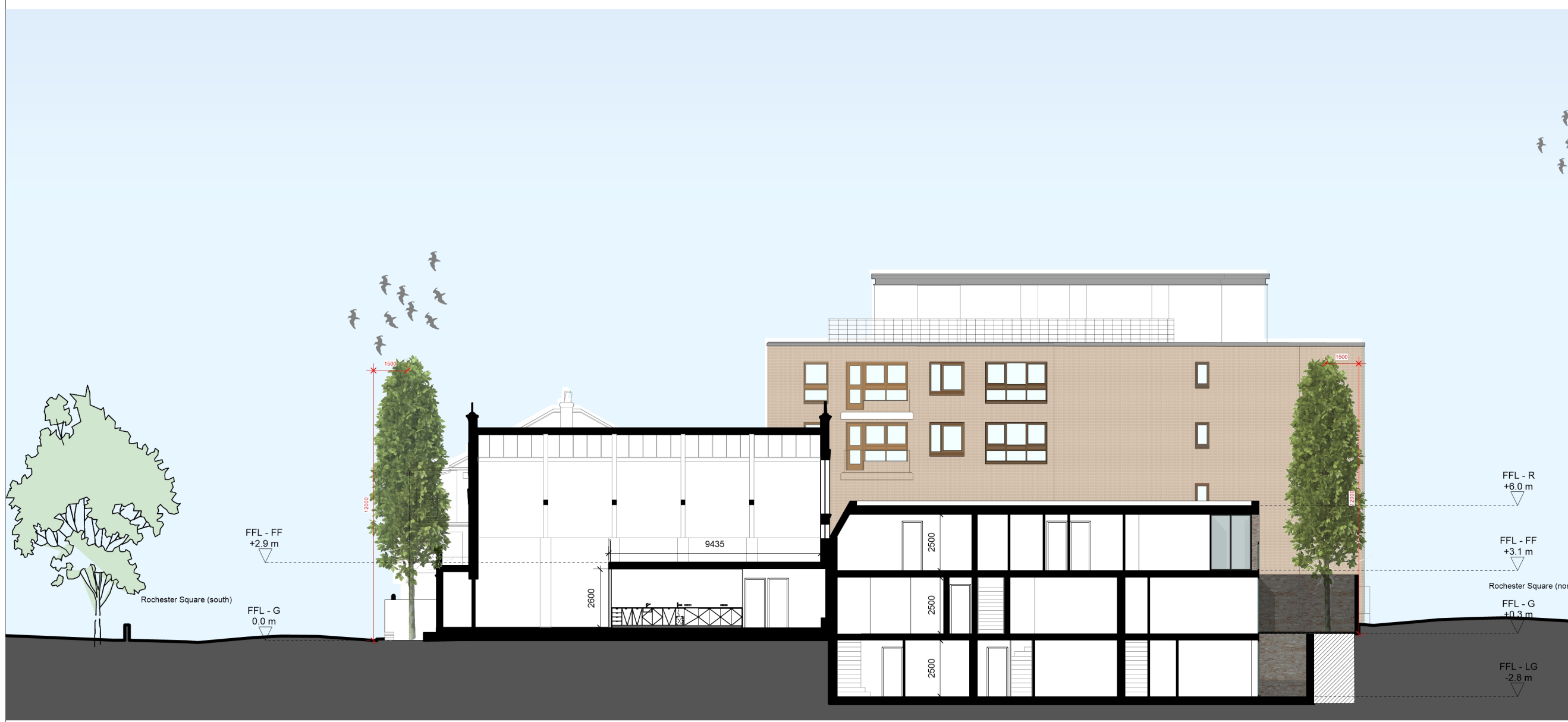
D PROPOSED SECTION - DD - With Proposed Trees 1:100 @ A1 / 1:200 @ A3

18 Wenlock Road London N1 7TA +44 (0)20 7033 3450 www.spacelab.co.uk