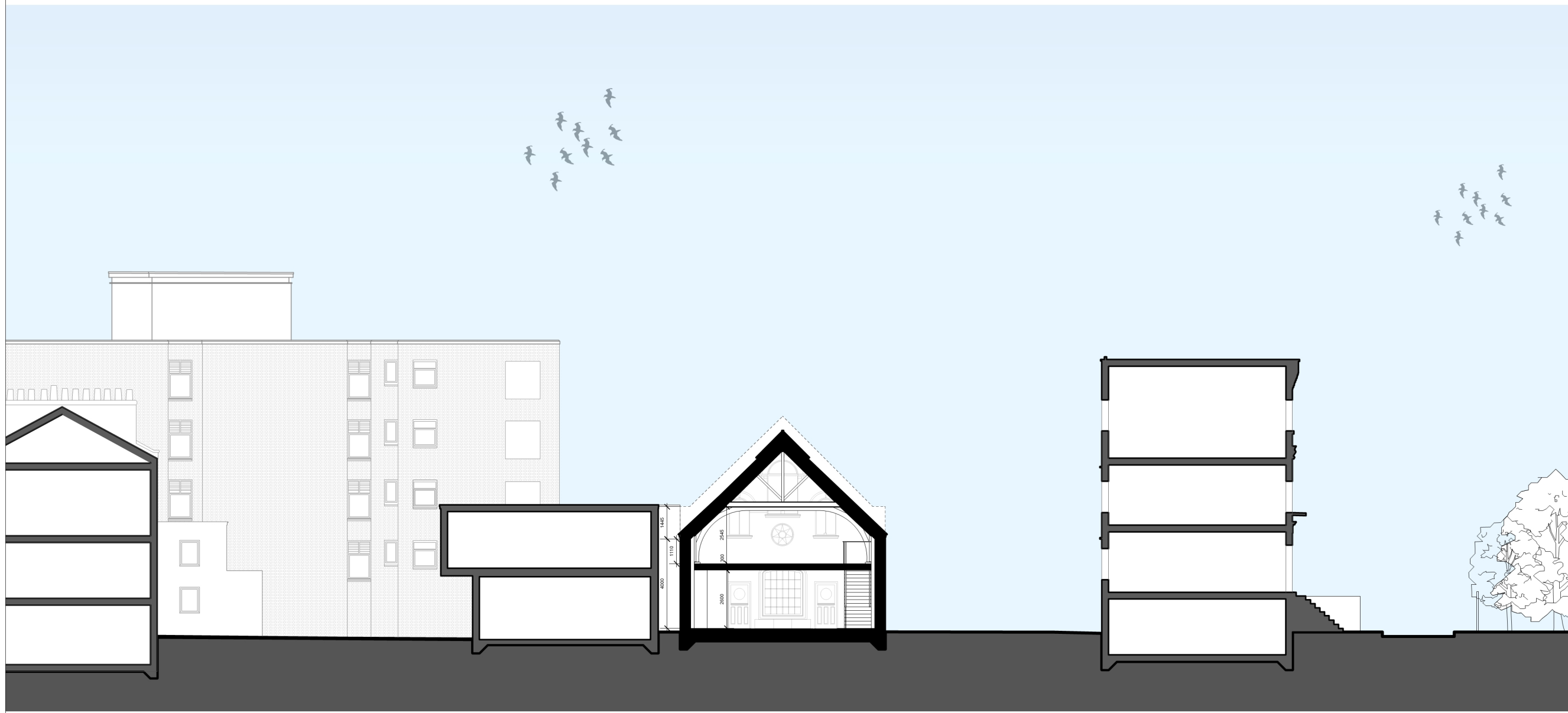
A | PROPOSED SECTION - AA 1:100 @ A1 / 1:200 @ A3

18 Wenlock Road London N1 7TA +44 (0)20 7033 3450 www.spacelab.co.uk