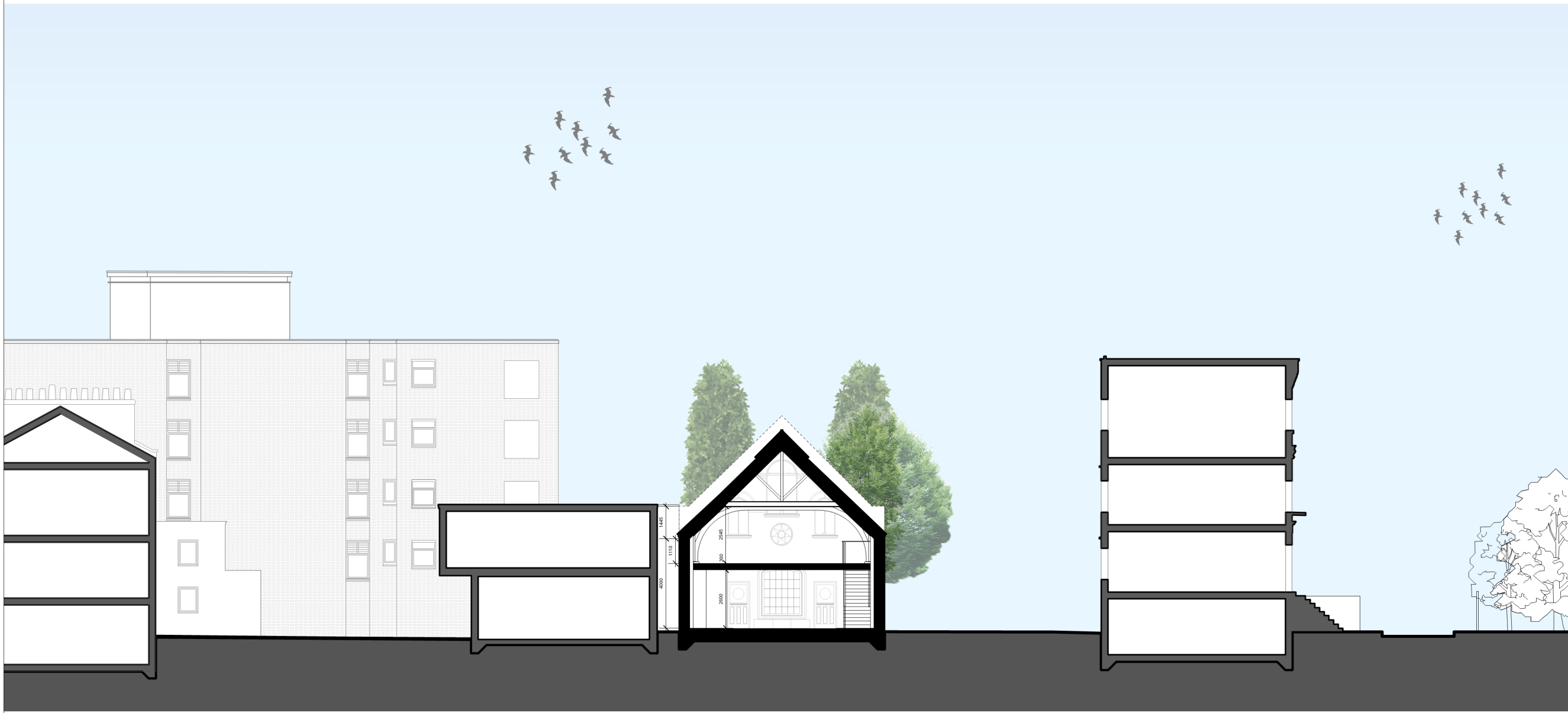
A PROPOSED SECTION - AA - With Proposed Trees 1:100 @ A1 / 1:200 @ A3

18 Wenlock Road London N1 7TA +44 (0)20 7033 3450 www.spacelab.co.uk