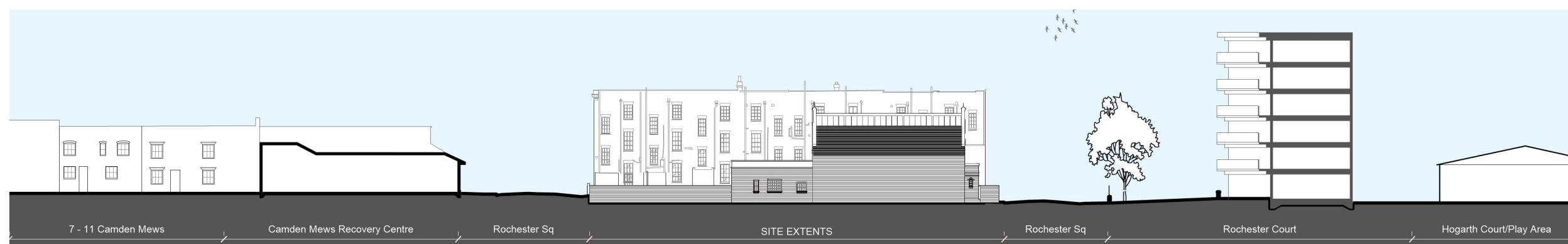
D Contextual Elevation - DD (West) 1:250 @ A1 / 1:500 @ A3