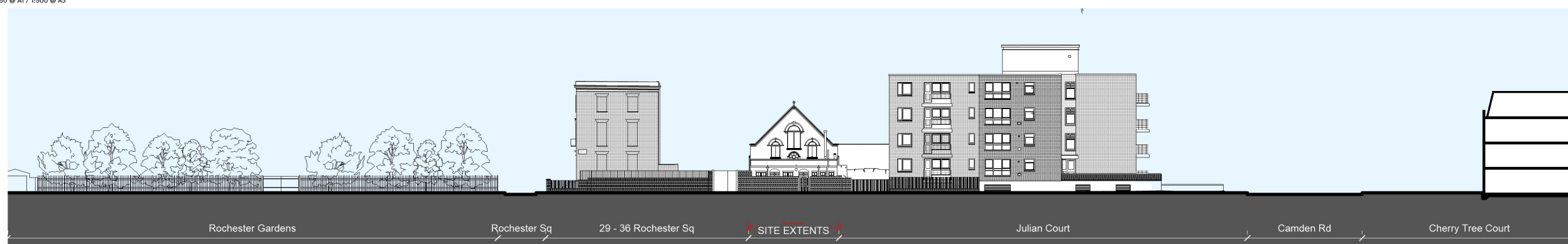
C Contextual Elevation - CC Rochester Sq. (North) 1:250 @ A1 / 1:500 @ A3