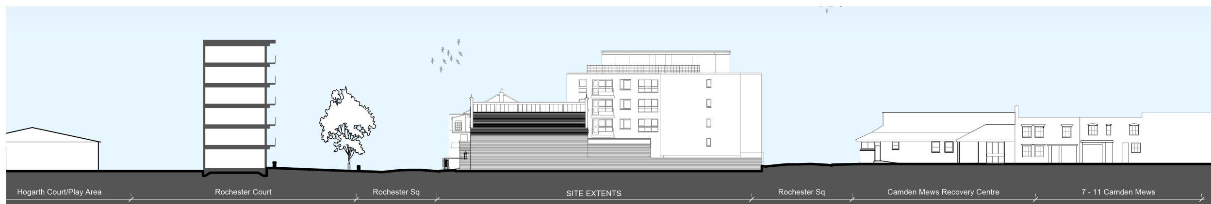
B Contextual Elevation - BB (East) 1:250 @ A1 / 1:500 @ A3