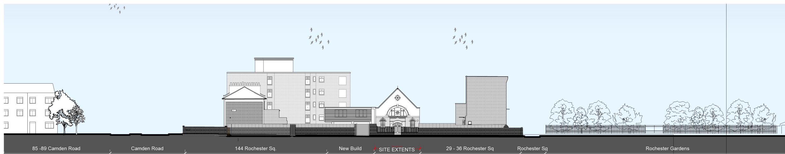
A Contextual Elevation - AA Rochester Sq. (South) 1:250 @ A1 / 1:500 @ A3