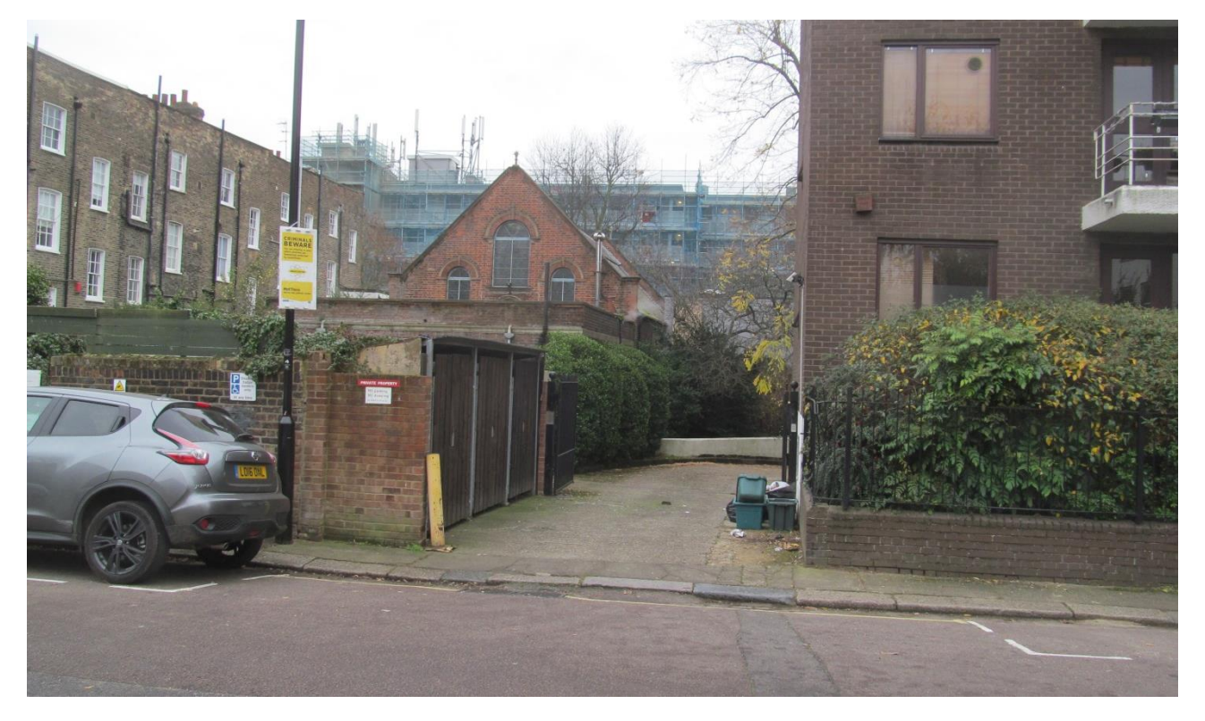
Photo 2 Rear of Temple and adjacent access to Julian Court basement car park Note 1 Parking Bay to rear of temple is a disabled bay.