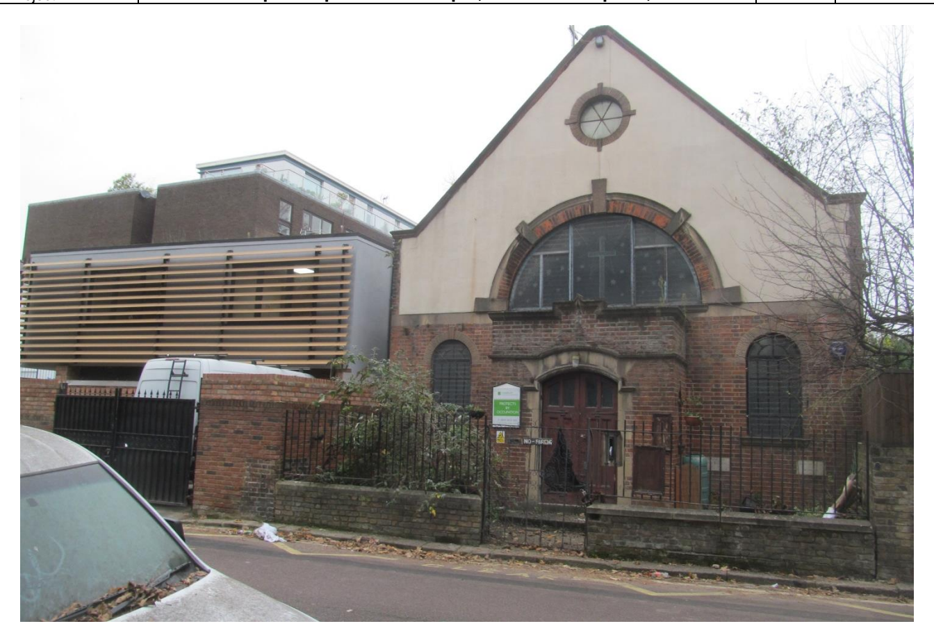
Photo 1 Entrance to Temple on Rochester Square West with Studio to the north Note 1 No pavement and zig-zags outside temple.