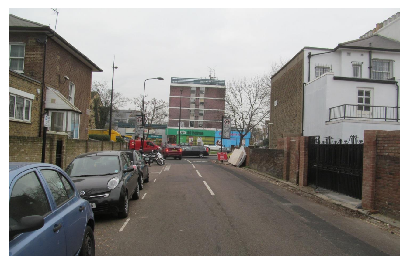
Photo 3 No restrictions at junction of Rochester Square West and A503, Camden Road. Note 1 Right hand turning lane on Camden Road.