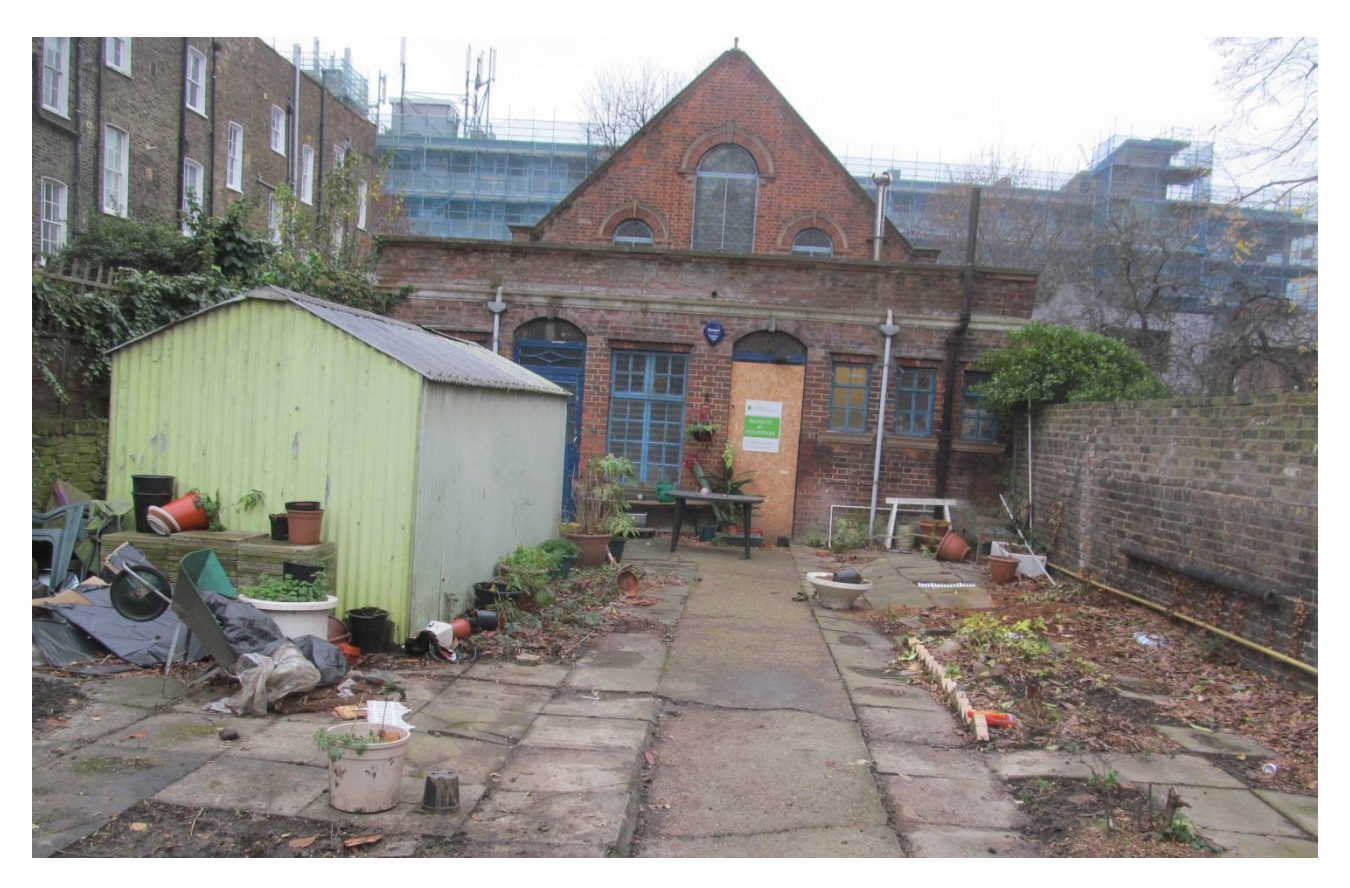
Photo 6 Temple rear yard and single storey offices with flat roof. [Offices to be demolished]