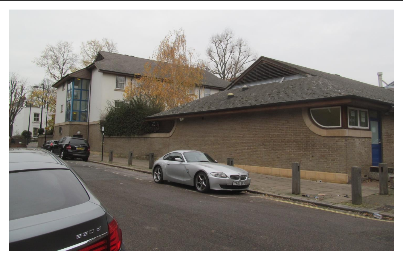
Photo 5 Parking bay on opposite side of Rochester Square East which will need to be partially suspended for wagon movements onto the site