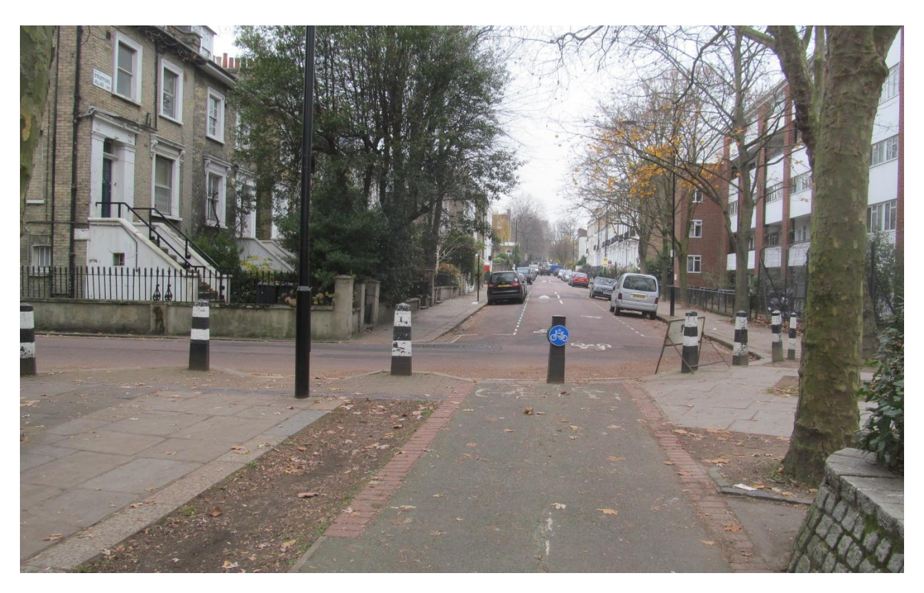
Photo 7 Cycle route as junction of Rochester Square West [to left] and Stratford Villas [straight ahead]