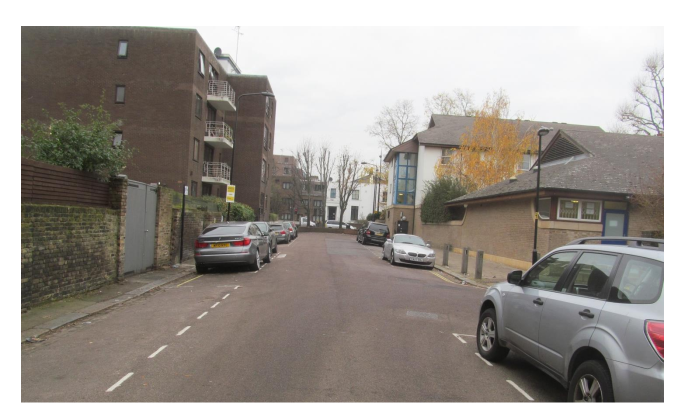
Photo 4 Junction of Rochester Square East and Camden Road blocked to vehicles with raised planter Note 1 Grey doors to rear garden of house to south of temple and Camden Mews to other side of road