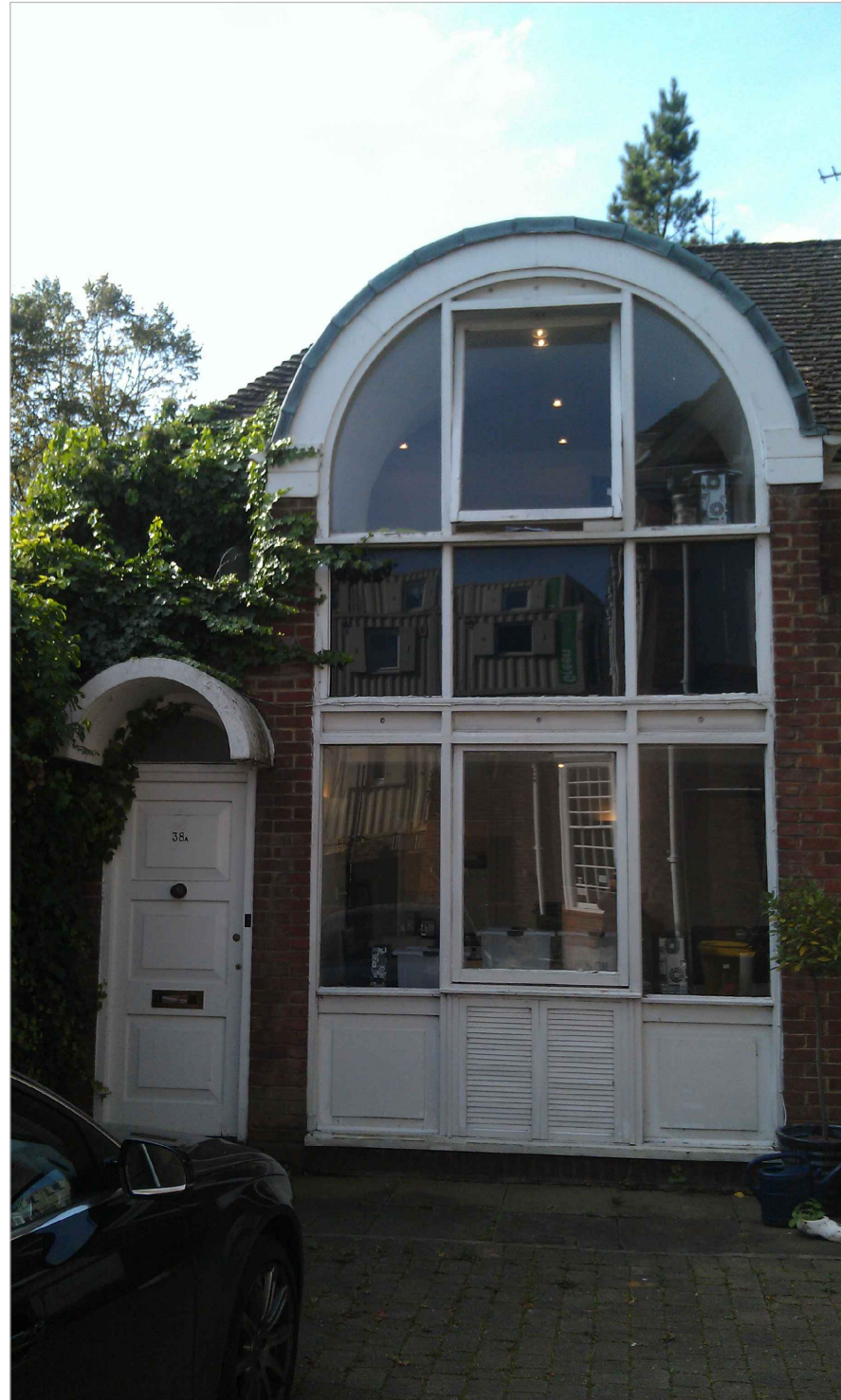
01 - EXTERIOR