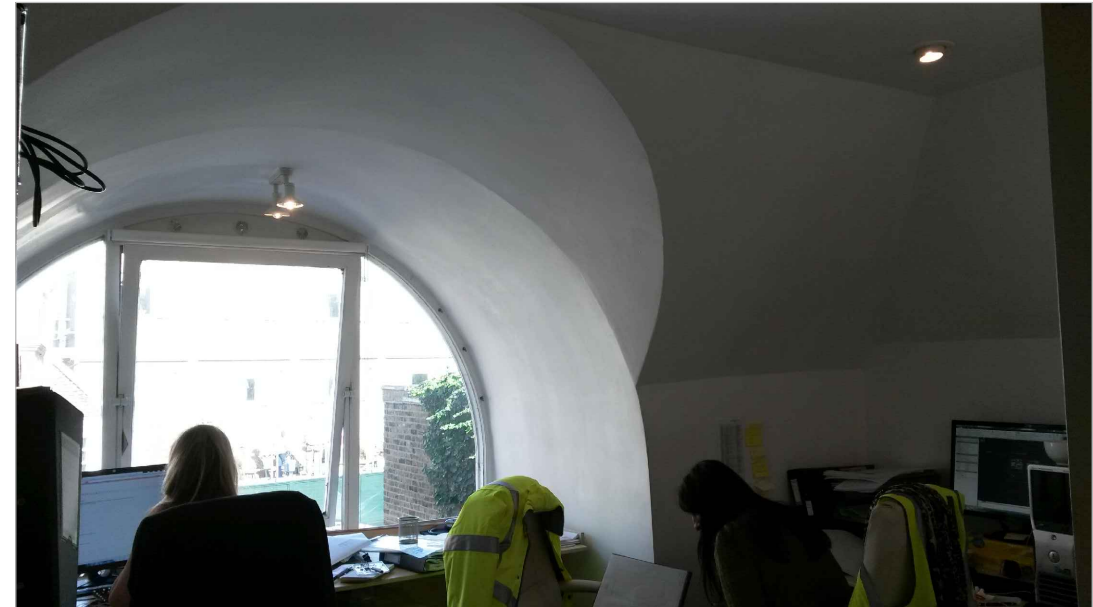
02 - UPPER OFFICE SPACE