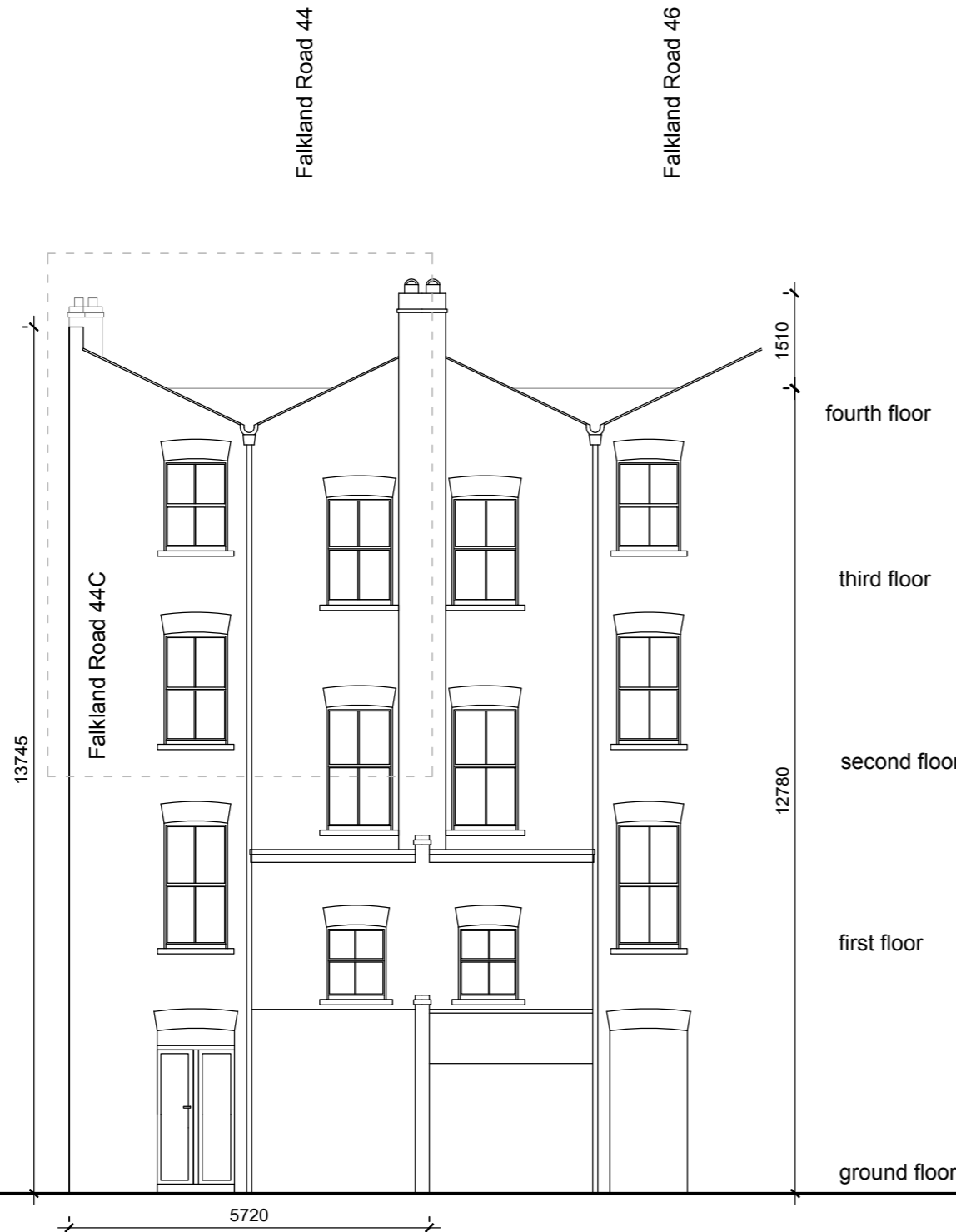
EXISTING SITUATION_REAR ELEVATION 44 FALKLAND ROAD