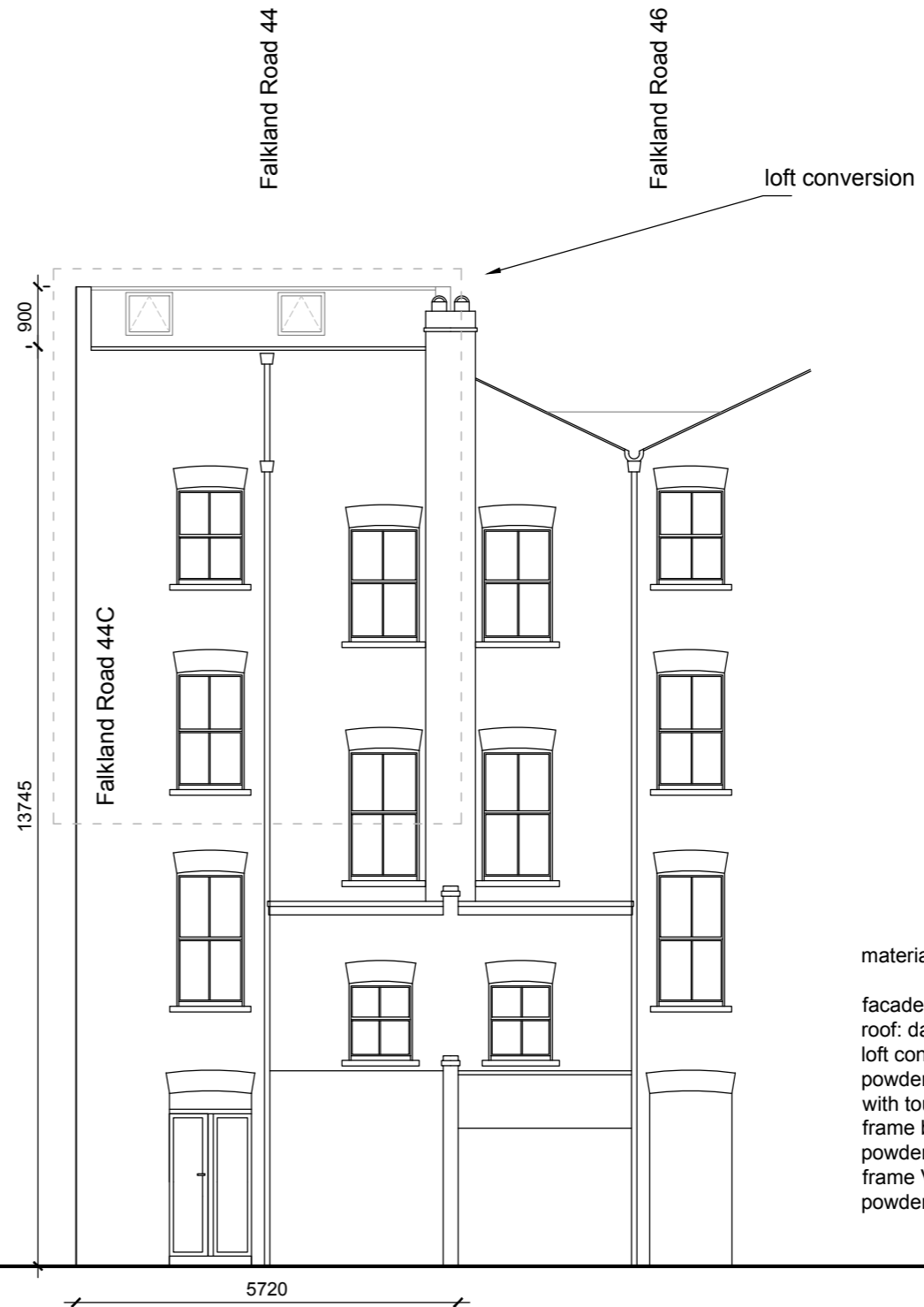
DESIGN PROPOSAL_REAR ELEVATION 44 FALKLAND ROAD