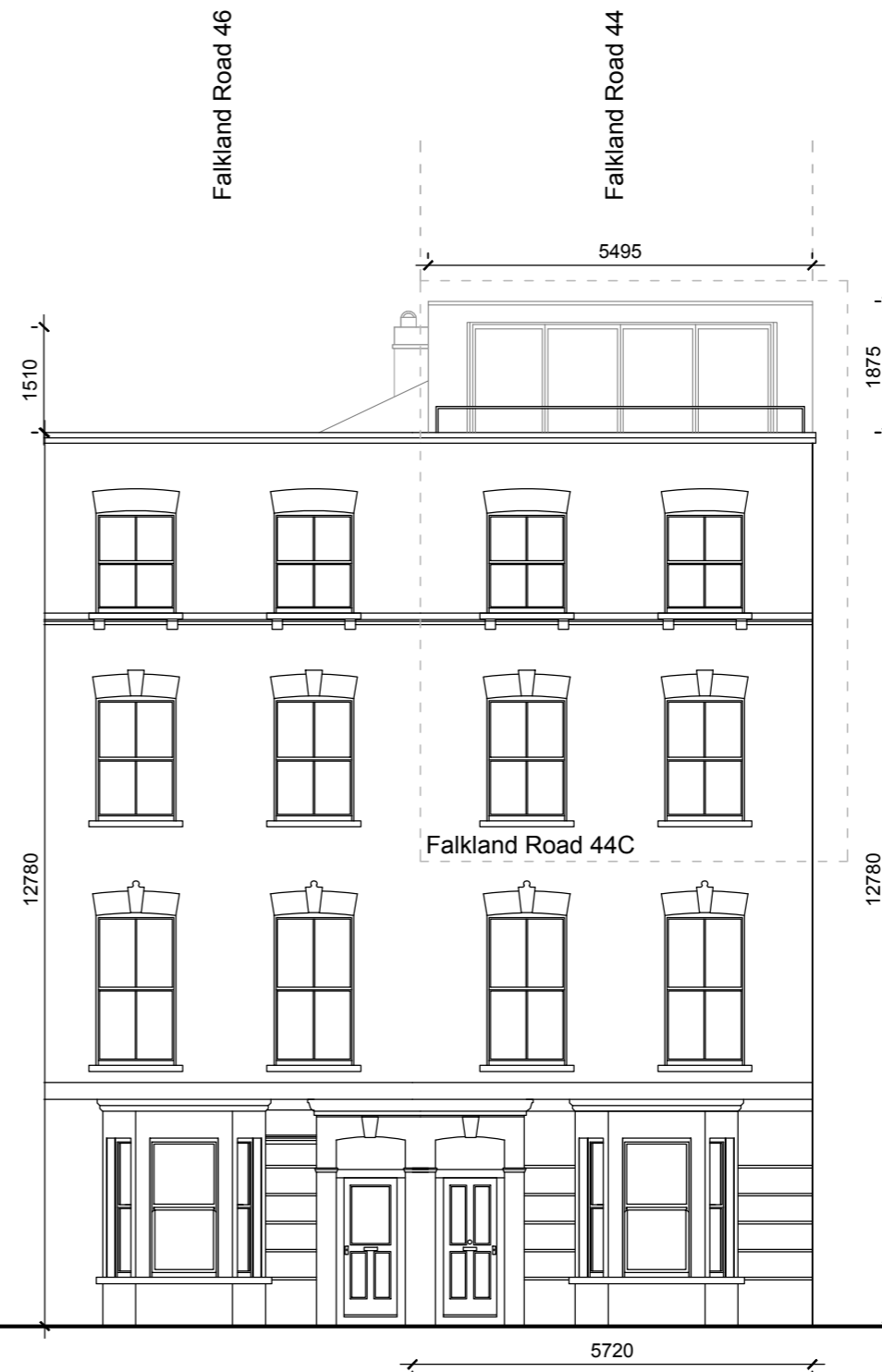
DESIGN PROPOSAL_FRONT ELEVATION 44 FALKLAND ROAD