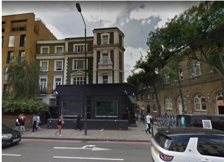
Figure 1 - View of property from Camden Road