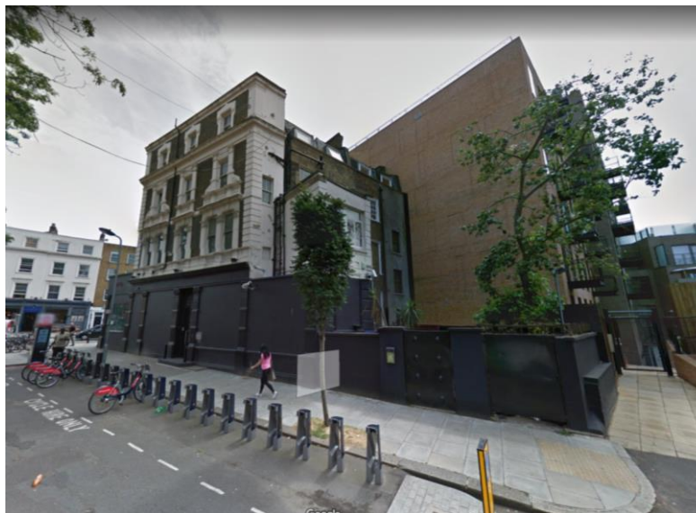
Figure 2 - View of property from Bonny Street