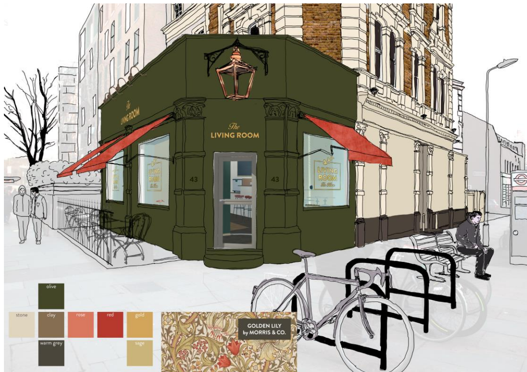
Figure 4 - Illustration of proposed alterations to frontage of property