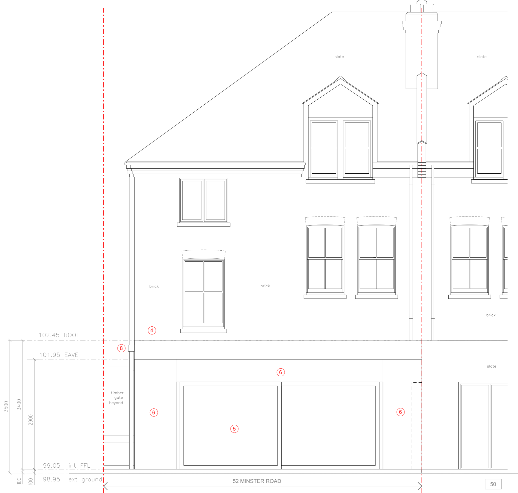
1 PROPOSED REAR ELEVATION - REAR EXTENSION