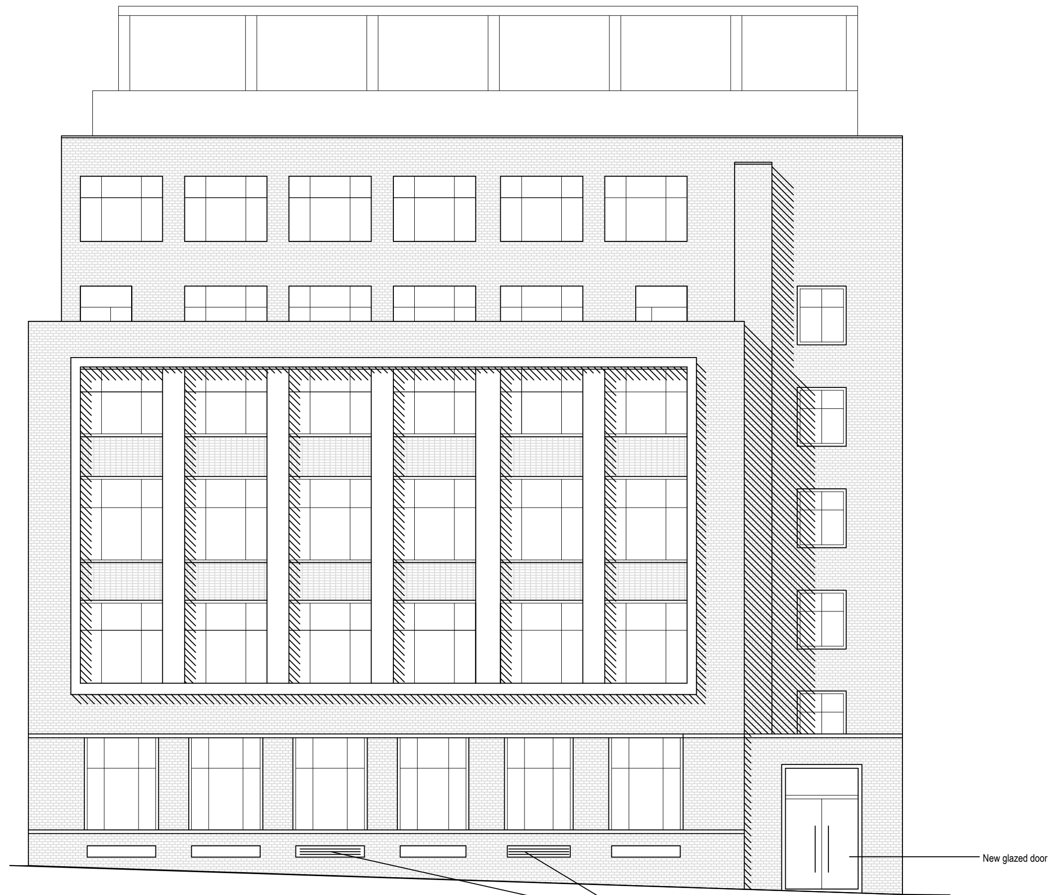
Saffron Hill Elevation

louvre grilles set into existing window frame for supply and extract air from internal fresh air plant.