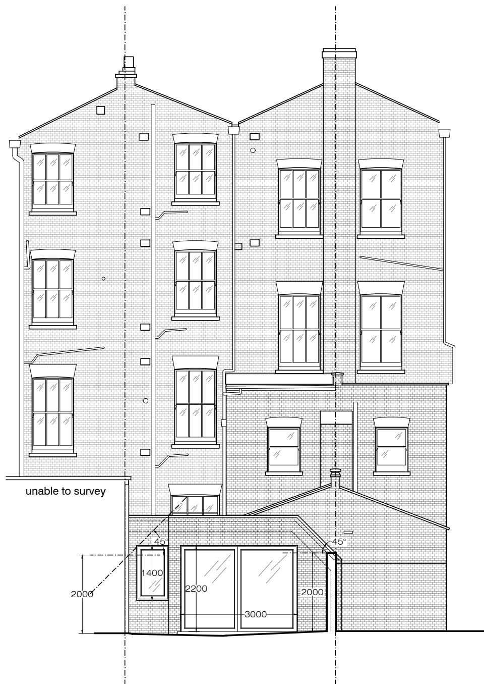
PROPOSED Rear Elevation SCALE 1:100@A3