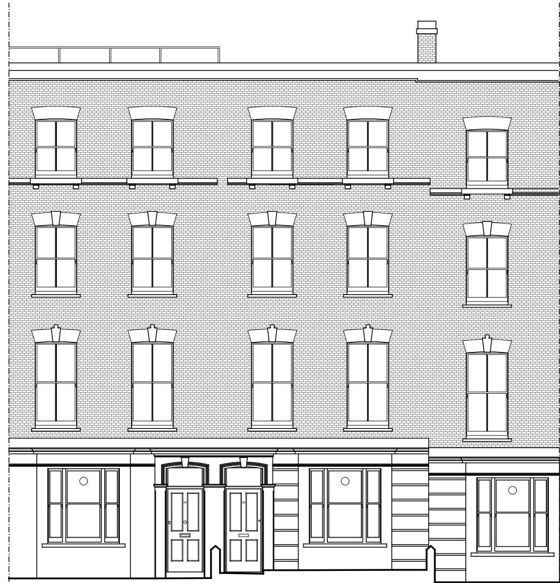
52A Falkland Rd