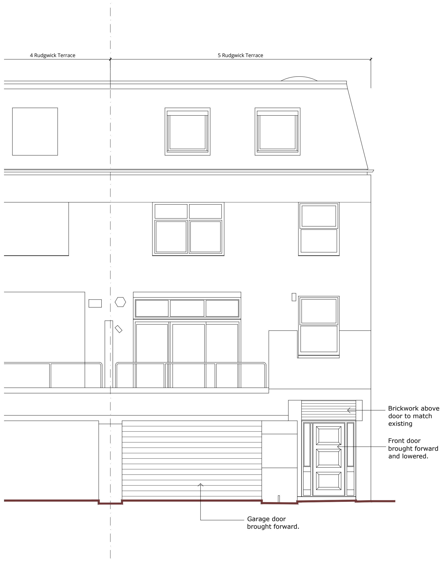
PROPOSED SOUTH ELEVATION scale 1:50