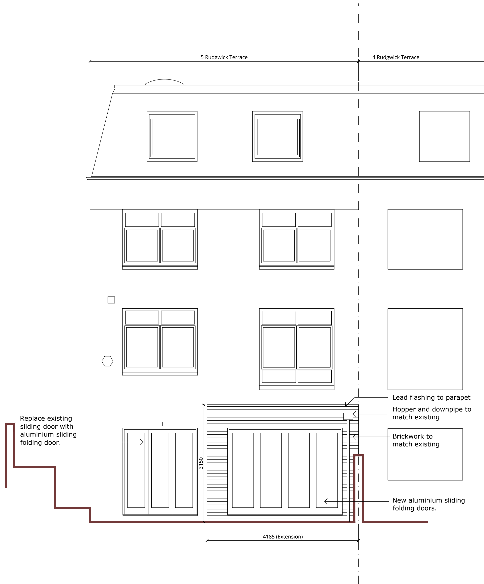
PROPOSED NORTH ELEVATION scale 1:50