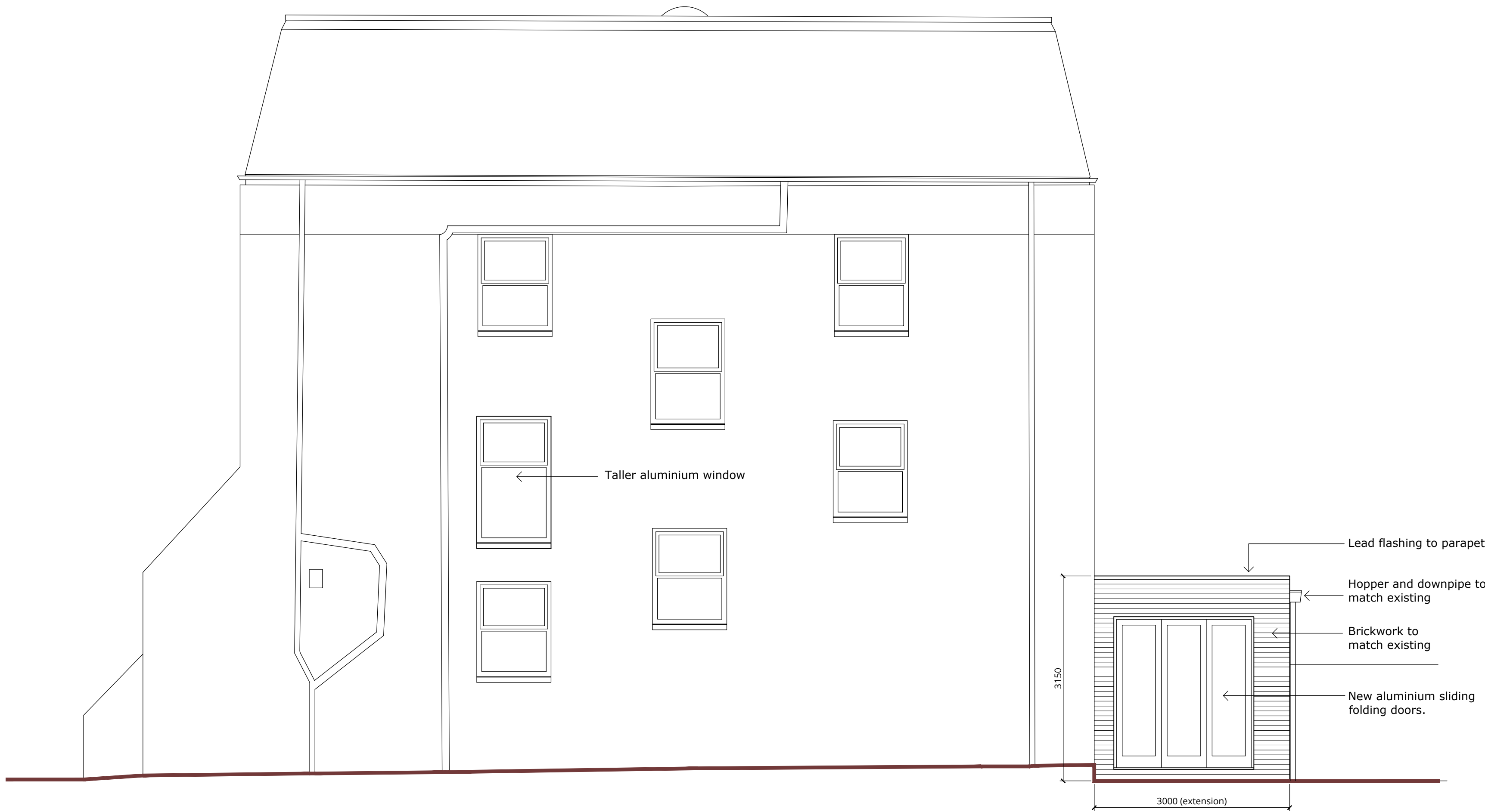
PROPOSED EAST ELEVATION scale 1:50

C 14.12.17 Notes added WB WD B 04.12.17 Scale corrected in title sheet WB WD A 01.12.17 Issued for approval WB WD Rev/Date Revision note By Chkd Status: PLANNING w d architecture ltd Design Studio 35 Balmoral Close, Bragbury End, Herts, SG2 8UAA T +44 (0) 7447 563 149 warren@wd-architecture.co.uk