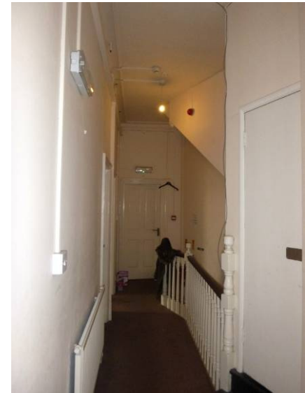
Figure 22: Corridor.