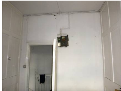
Figure 24: Bedroom.