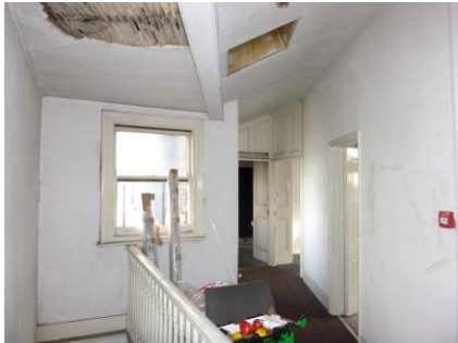
Figure 23: Corridor.