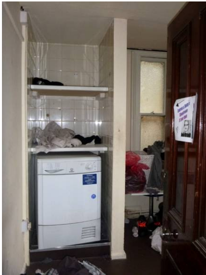
Figure 17: Rear room.