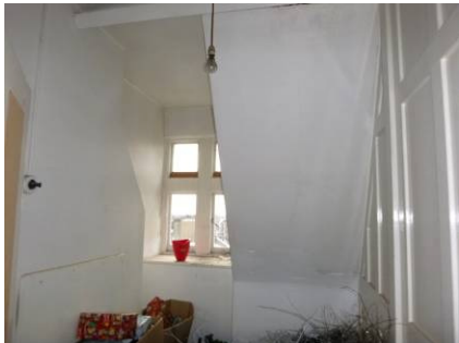
Figure 25: Bedroom.