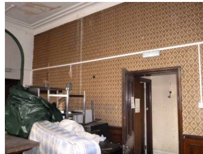
Figure 15: Principal room.