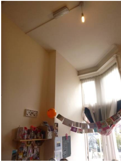
Figure 11: Room with modern partition.