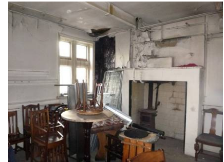
Figure 28: Redundant kitchen.