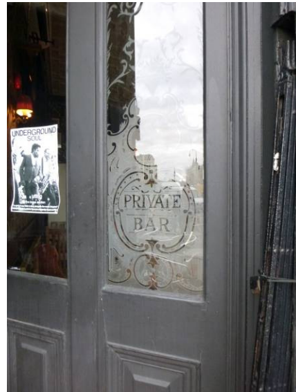
Figure 10: Etched glass.