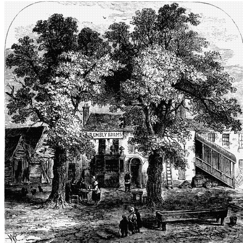
Figure 3: Assembly House, 19th century.

and where many cheerful evenings were spent as far as the Glass and Pipe could furnish, to pass a convivial hour, which often cheered their buoyant spirits and sent them home 'merry'.' (Figure 3).