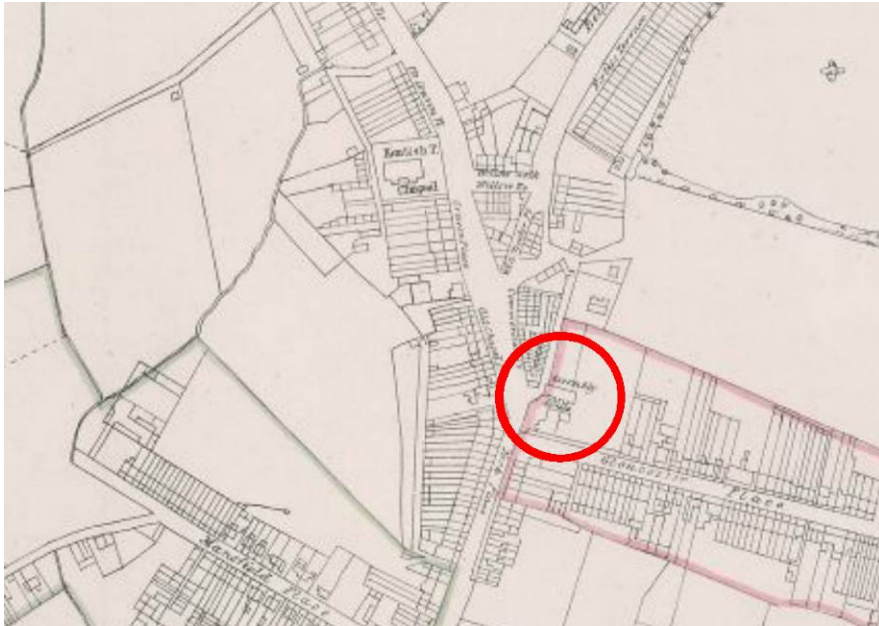
Figure 2: Plan of the Hamlet of Kentish Town, 1810.

courts are noted as having been held here between the years 1810 and 1842. A map from 1810 shows the Assembly House and the little development around the area at the time (Figure 2).