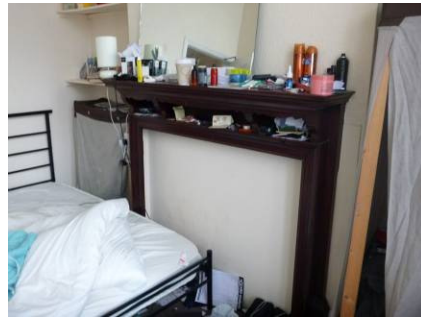
Figure 12: Blocked fireplace.