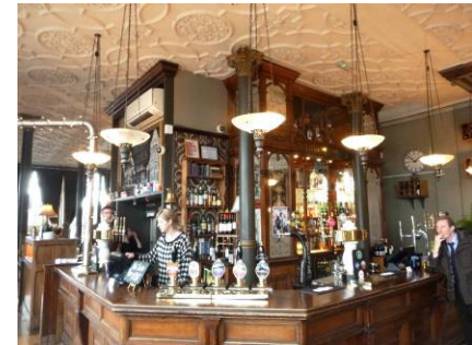
Figure 8: Main bar.