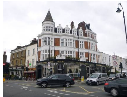
Figure 7: View from southwest corner of Kentish Town Road and Leighton Road.