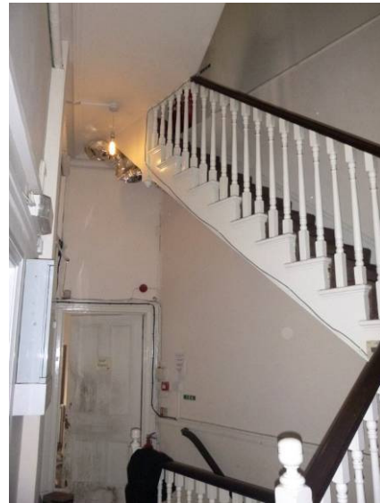
Figure 18: Staircase.