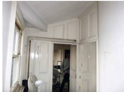
Figure 26: End of corridor.