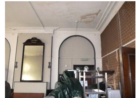
Figure 16: Principal room.