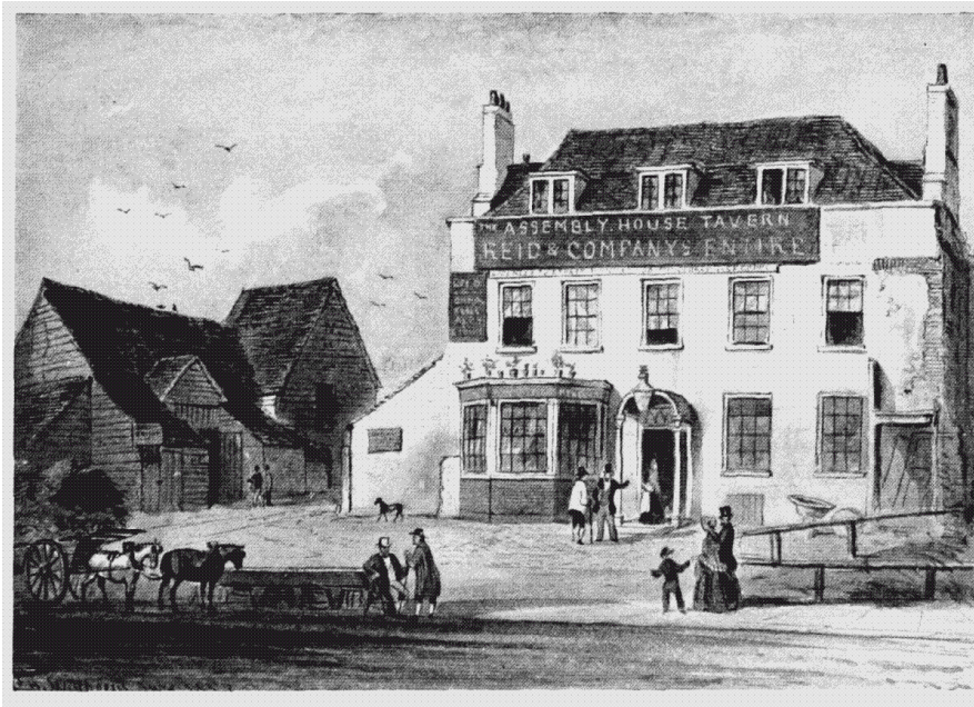
Figure 6: Assembly House, 1853.