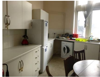
Figure 13: Contemporary kitchen.