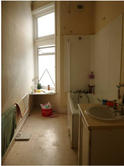
Figure 19: Bathroom.