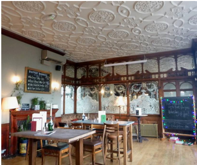
Figure 4: Main bar area with etched glass and Jacobean-style plaster ceiling.

The interior of the bar area has remained remarkably intact, in particular the etched decorative glass and plaster moulded ceiling. Previous planning consents include the insertion of a micro-service lift on the ground and basement floors as well as air conditioning units on the roof. Other internal alterations include the insertion of a wall in a large room on the first floor in 2010 (2010/6397/L)(Figure 5) to subdivide it into two smaller rooms and some other partition rearrangement. A full planning history can be found in Appendix 1.