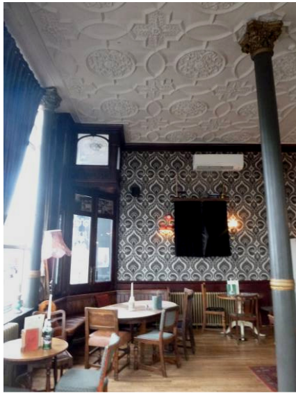
Figure 9: Ground floor bar area.