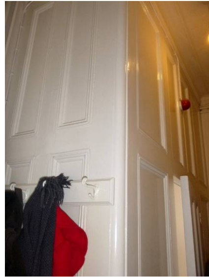
Figure 20: Early walls housing toilet area.