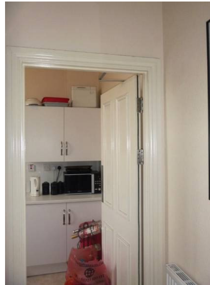
Figure 21: Modern kitchen.