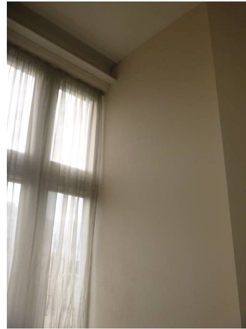
Figure 5: Clean insertion of internal partition wall abutting window granted in 2010.