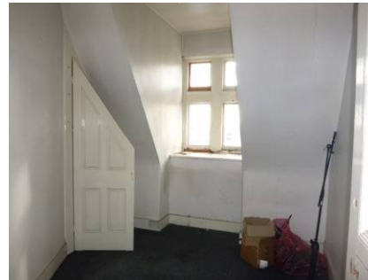
Figure 27: Bedroom.