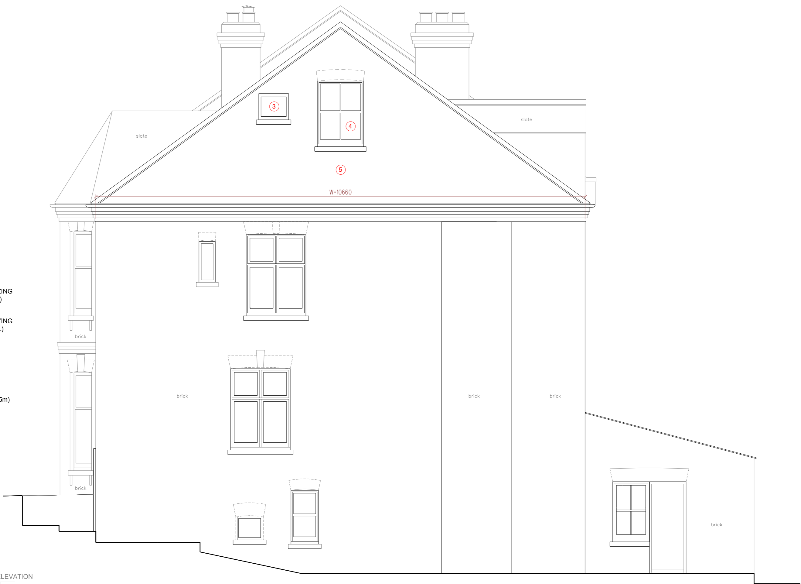
1 PROPOSED SIDE ELEVATION - LOFT EXTENSION

HIP-TO-GABLE VOLUME = (W x 1/2L) x 1/3H = 10.66m x 1/2(5.33m) x 1/3(3.95m) = 37.4m3